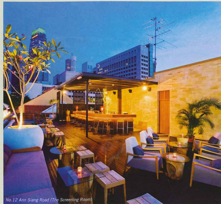
No. 12 Ann Siang Road (The Screening Room)