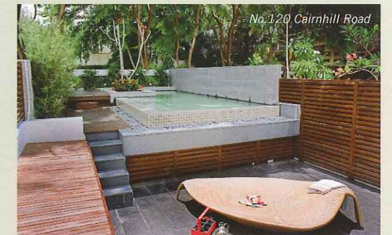
No. 120 Cairnhill Road

The Sea View Clubhouse along Amber Road was abuzz with activities on 3 October 2008 with more than a hundred building owners, architects and professionals gathered there for a special occasion. The beautifully restored Neo Classical building hosted the 2008 URA Architectural Heritage Awards – an annual event that celebrates well restored heritage buildings.