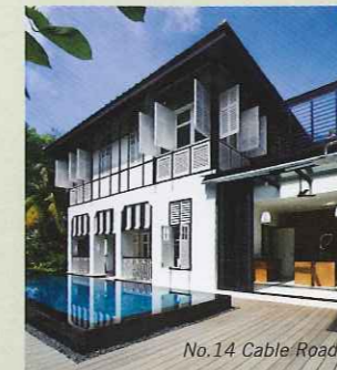
No. 14 Cable Road