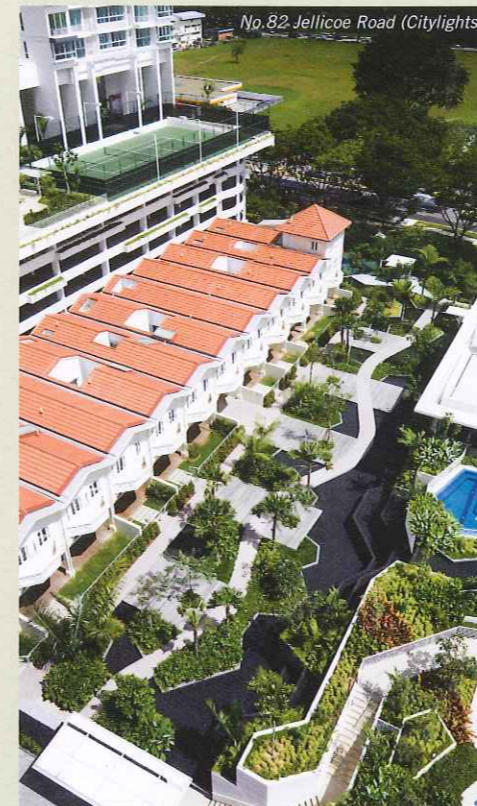
No. 82 Jellicoe Road (Citylights)

Well restored residences were in the limelight for the 2008 URA Architectural Heritage Awards. Among them – Sri Temasek, a colonial style bungalow where the Prime Minister delivered his National Day message this year. Here's a snapshot of all the winning projects.