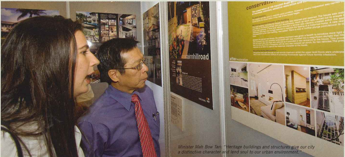
Minister Mah Bow Tan: "Heritage buildings and structures give our city a distinctive character and lend soul to our urban environment."

Skyline would be featuring each of the 2008 winners in the subsequent issues.