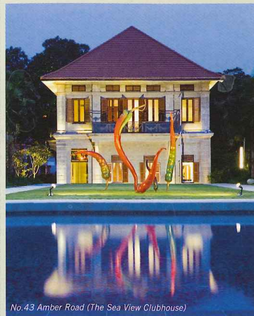
No. 43 Amber Road (The Sea View Clubhouse)