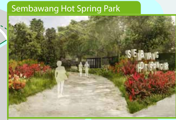
Sembawang Hot Spring Park