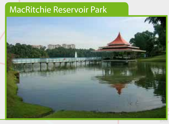
MacRitchie Reservoir Park