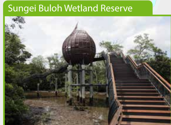
Sungei Buloh Wetland Reserve