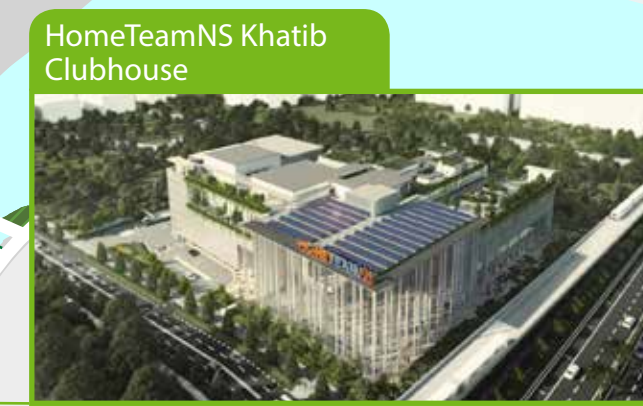
HomeTeamNS Khatib Clubhouse