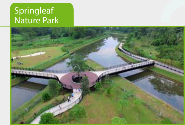
Springleaf Nature Park