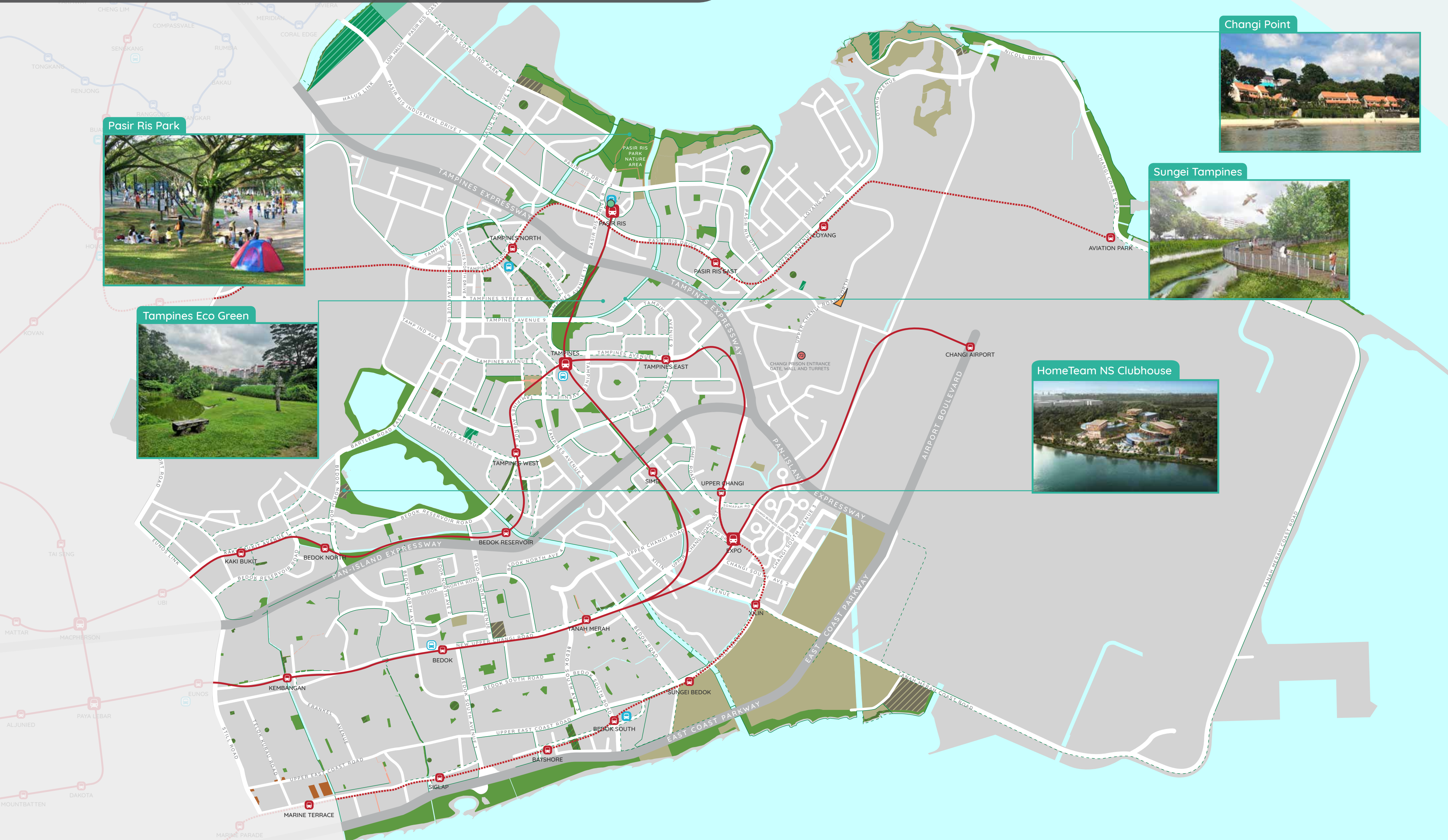
Pasir Ris Park