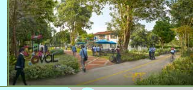
Oval @ Seletar