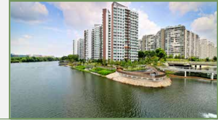
ABC Waters @ Serangoon Reservoir