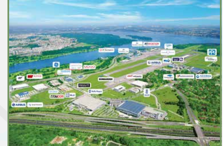
Seletar Aerospace Park