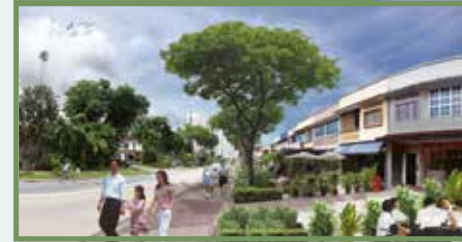
Jalan Kayu Environmental Improvement Project