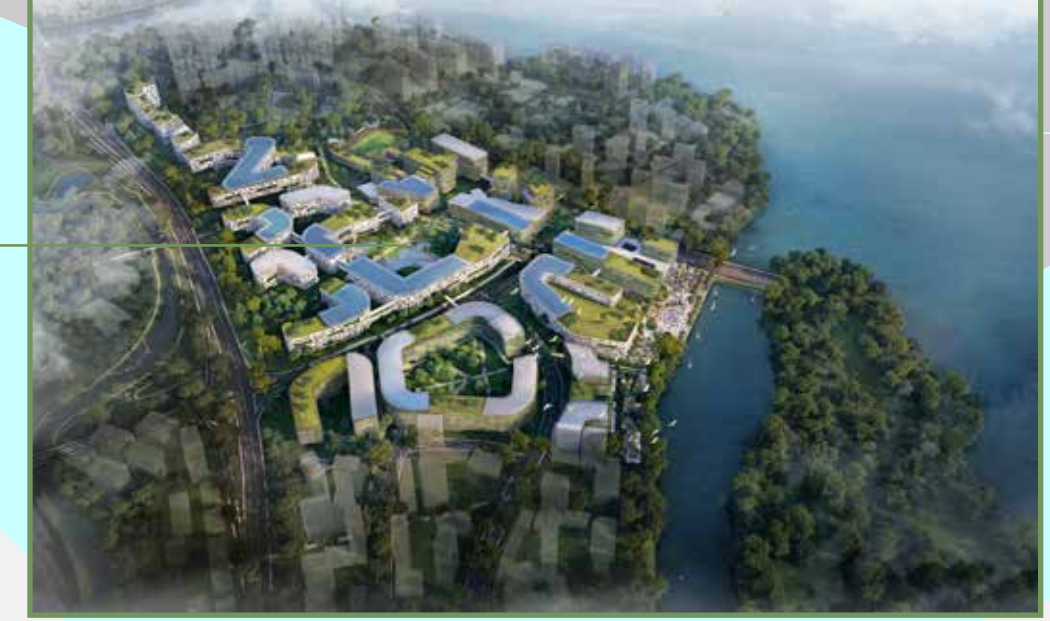
Punggol Digital District