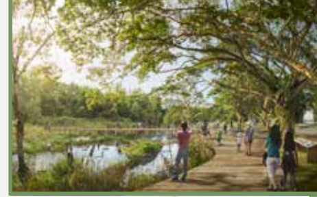
Park at Hampstead Gardens