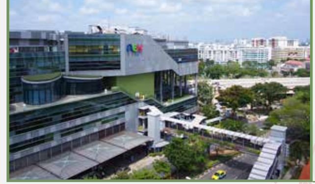
Serangoon Sub-Regional Centre