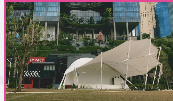
Revamped Hong Lim CC