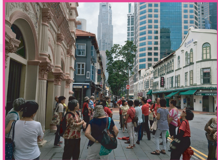
Promoting the history in Chinatown