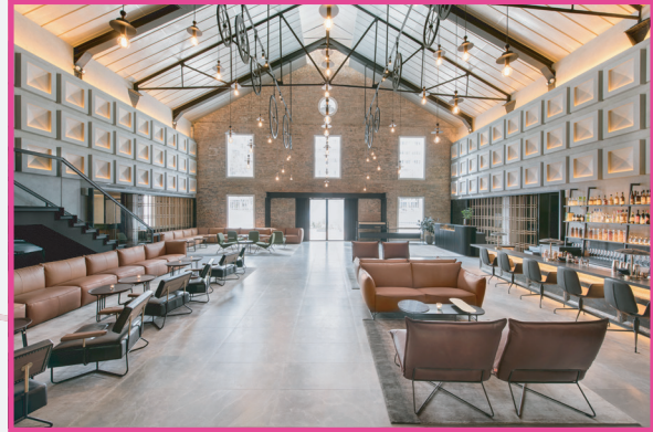
Warehouse Hotel Restored