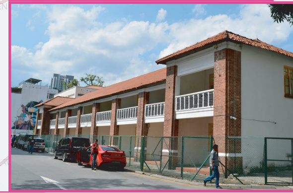
Heritage buildings for interim use at Little India