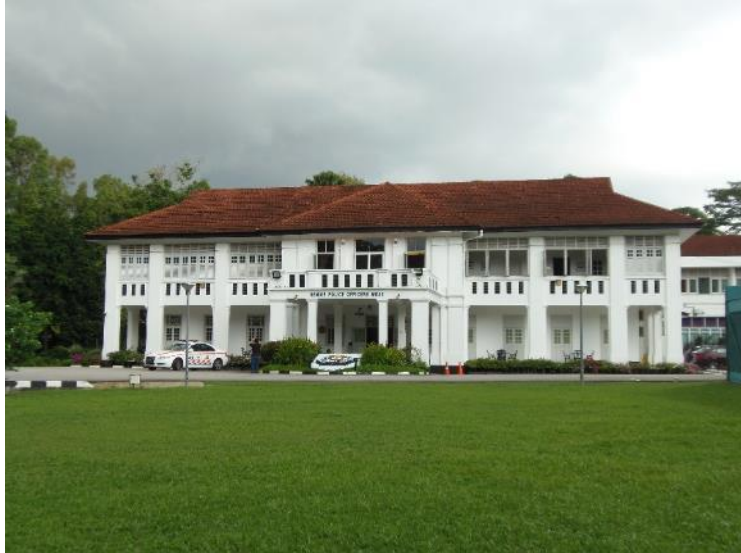
Blk 153 - Senior Police Officers' Mess (SPOM)