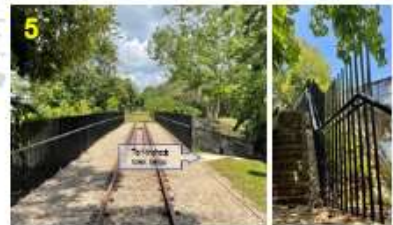
Restored brick steps on the slope next to the Hindhede Bridge, leading to Hindhede Walk, where you can walk to Bukit Timah Nature Reserve