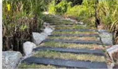
Landscaped stairs at the southern end of the Upper Bukit Timah Truss Bridge leading to Rail Mall