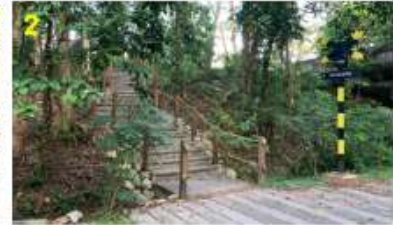
Landscaped stairs on the slope next to Singapore Quarry Bridge, which will lead you to Dairy Farm Nature Park