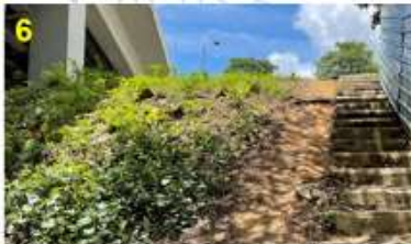
Restored staircase leading to Jalan Anak Bukit under the Pan-Island Expressway (PE) viaduct.