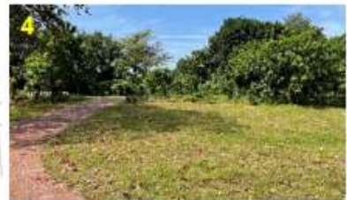
4m wide porous binded aggregate path to the Bukit Drive, where you can walk to Bukit Timah Nature Reserve