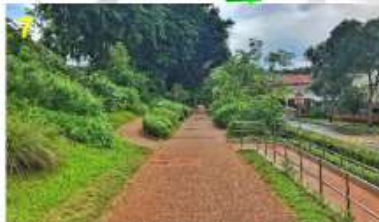
Barrier-free access linking the bus-stop at Jalan Anak Bukit and Mayfair Park Estate