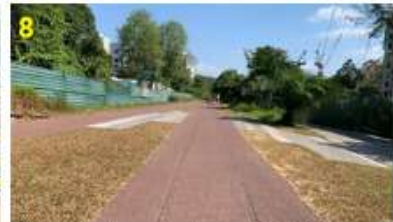
A porous binded aggregate path at the Bukit Timah Railway Station, with rail markings embedded at the exact position of the former railway track