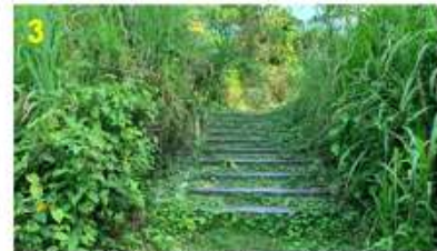
Rustic trail with a flight of steps to the end of Hindhede Walk and near Springdale Condominium