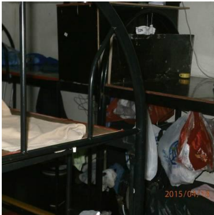
Photo 1: Workers lived in cramped and cluttered conditions in the PRP.