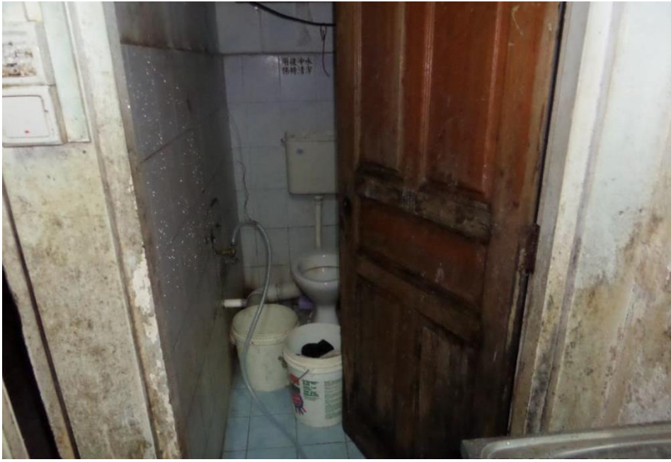
Photo 3: The toilet facilities were unsanitary and inadequate to serve the needs of the foreign workers.