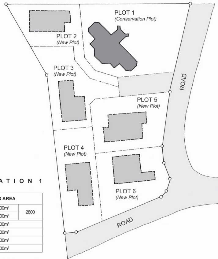
Figure 4 : Good Class Bungalow Area