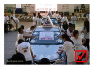
Car display as an integral part of an interactive event