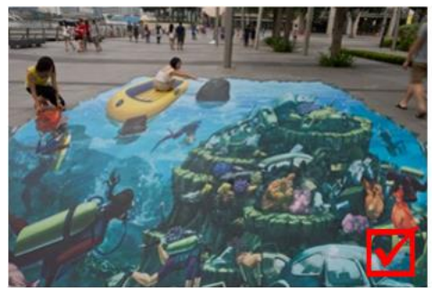
Floor art not containing commercial branding

Floor stickers are not allowed unless they are displayed as a form of public art e.g. trick eye or graphic signs without commercial messages.