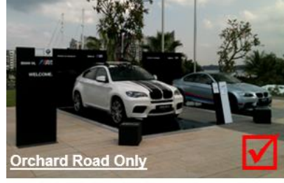
Car promotion/ sales

Event related messages such as "Official car sponsor of XXX event" or event title / information / details would need to be displayed on the car or the backdrop, and advertisements on the car / car functions, car manufacturer / distributor would not be permitted.