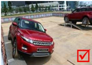
Car display as part of an activity within an event