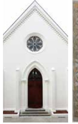
Historic features retained