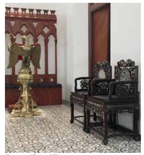
Harmony of East and West