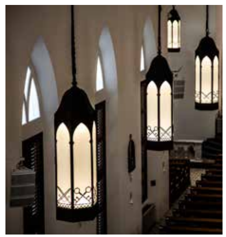
Newly designed lamps