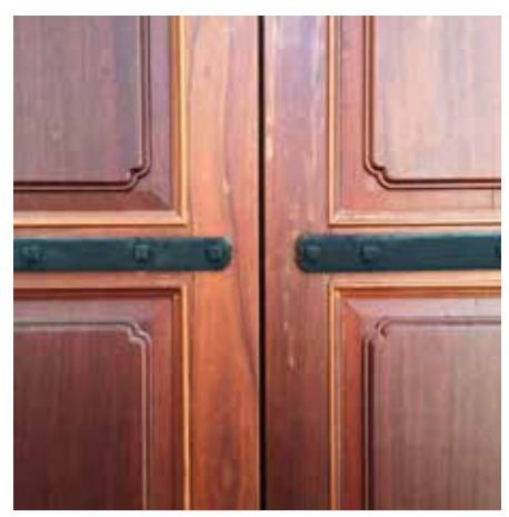
Old timber doors reconditioned