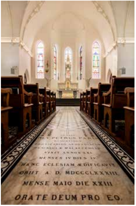
Old marble aisle