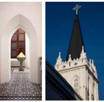
Plaster details of Gothic-style