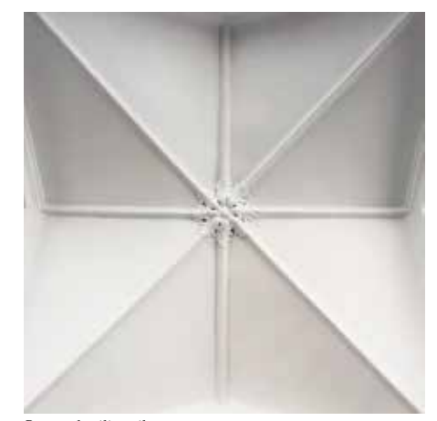
Restored ceiling ribs