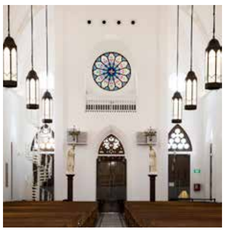
View towards main entrance door