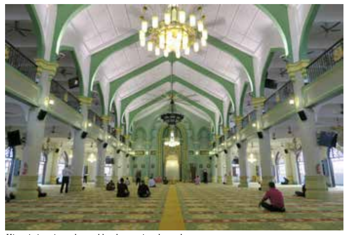
Historic interior enhanced by showcasing the arches