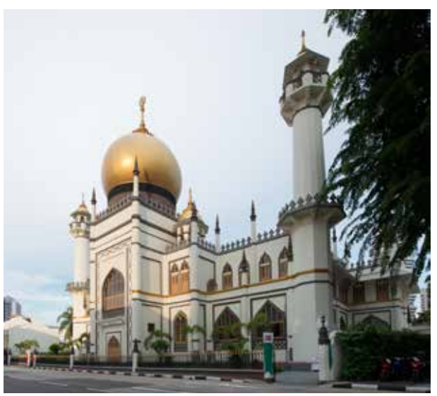
A well maintained landmark by the community

Thoughtful upgrades have raised the value and relevance of the original building for the present and the future. To ease the way up to the prayer hall for its growing congregation as well as the aged, a new translucent glass lift structure was added in a discreet location, with