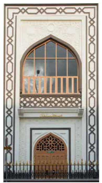
Original woodwork retained