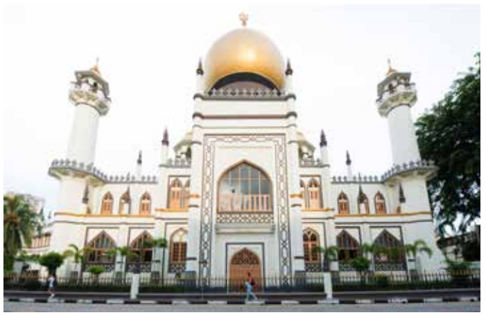
New colour scheme to give a stately appearance