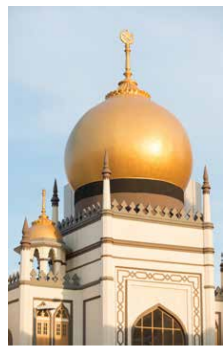
Dome with depth of colour