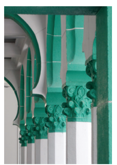
Restored columns and capitals