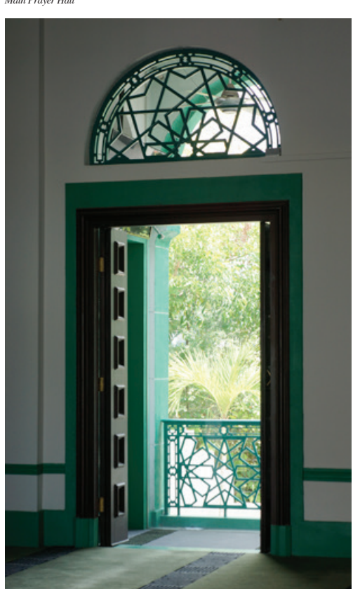
Original timber doors and cast-iron grilles retained