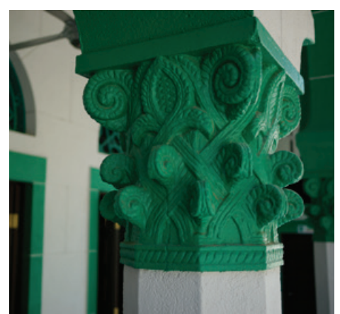
Finely restored capitals