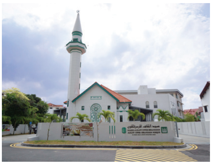
Alkaff Upper Serangoon Mosque restored as a landmark

A significant specimen of architectural and social history has been preserved and renewed - thanks to the generosity of the community that has always rallied together with pride over the 80-plus-year old building. Working on a modest budget, the restoration has secured a living heritage site for the Mosque's growing congregation and its neighbouring community, for now and for generations to come.