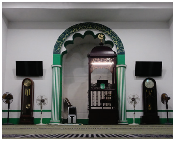
Main Prayer Hall