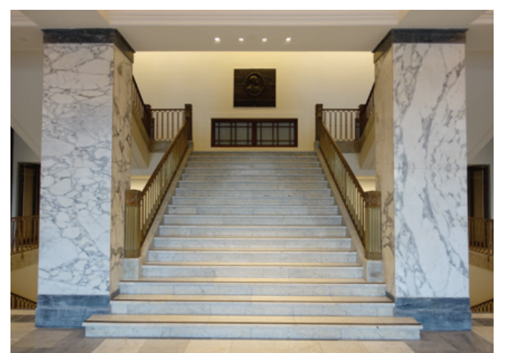
Grand staircase with original marble panelling and steps at former City Hall