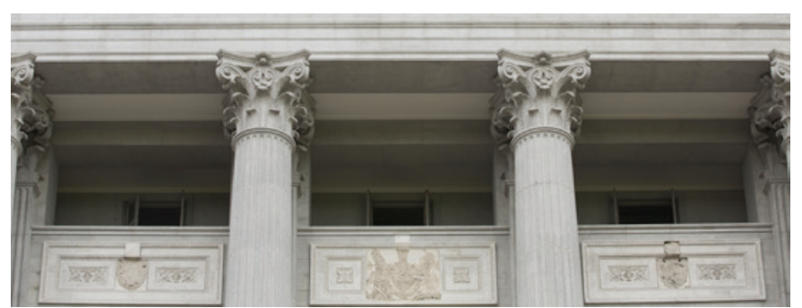
Shanghai plaster Corinthian capitals of former Supreme Court