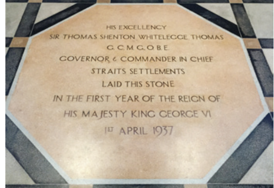
Time capsule at former Supreme Court