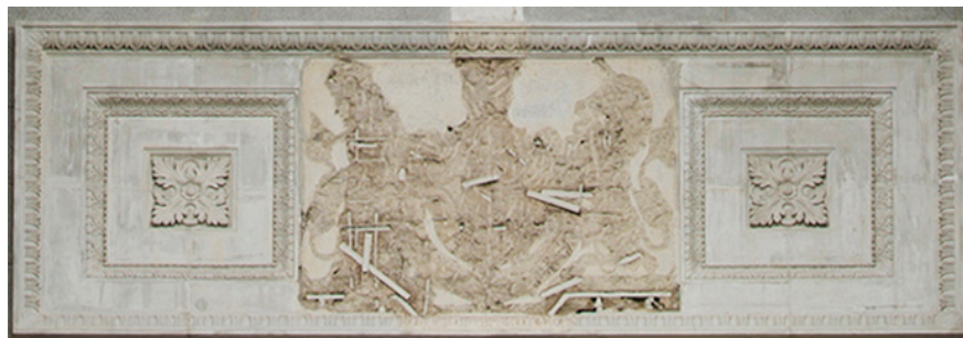
Remnants of damaged crests retained at former Supreme Court