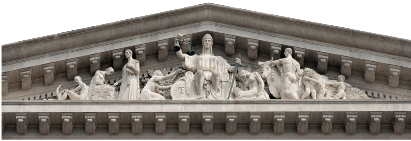
Original tympanum scupltures at former Supreme Court