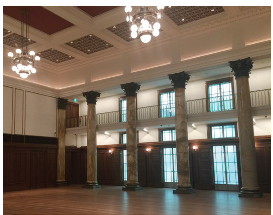
Restored interior of former City Hall Chambers