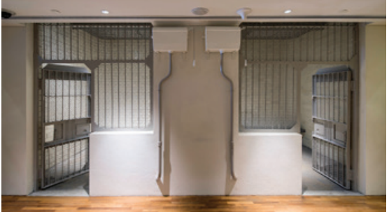
Jail cells at former Supreme Court restored and adapted into gallery space