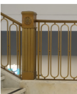
Polished brass balustrades