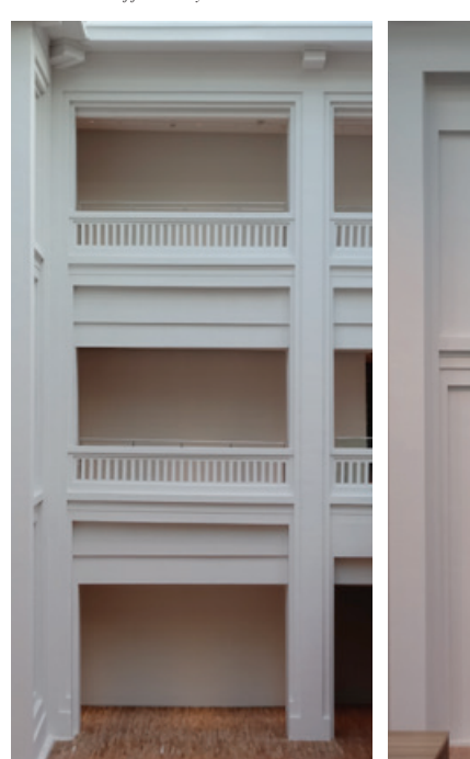
Courtyard façades of the former City Hall retained