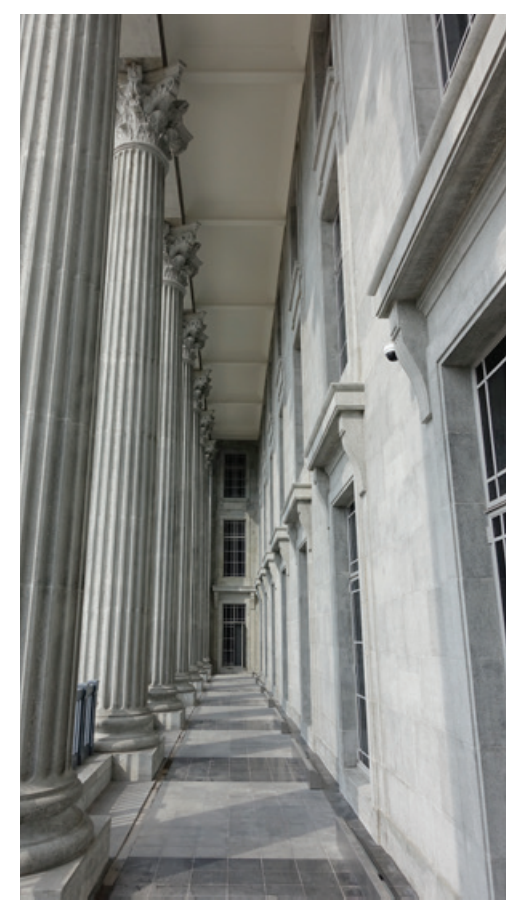
Sensitively restored Shanghai plaster columns and inner façade at former City Hall