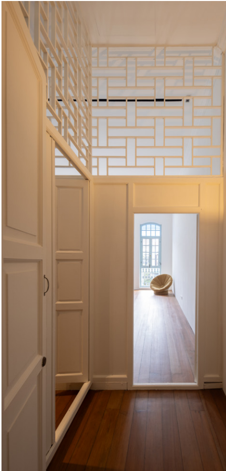
Long hidden timber lattices - a rare feature, were discovered and carefully restored