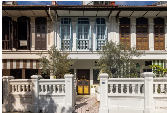
A historic elegance carefully revealed

The systemic research and documentation guided the scope of the restoration works. The later-added curved "pantile" roof tiles were removed and replaced with traditional V-shaped tiles, reinstating the roof's original design. The façade, previously covered in thick layers of paint, was restored through detailed paint analysis. Archival research, manual paint stripping, and delicate stucco repair revealed the building's original 1924 palette. White paint was used on trimmings of the restored plaster mouldings, enhancing the façade's visual depth and accentuating its crisp architectural details.