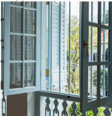
Original interior elements and decorations meticulously restored to reveal period charm