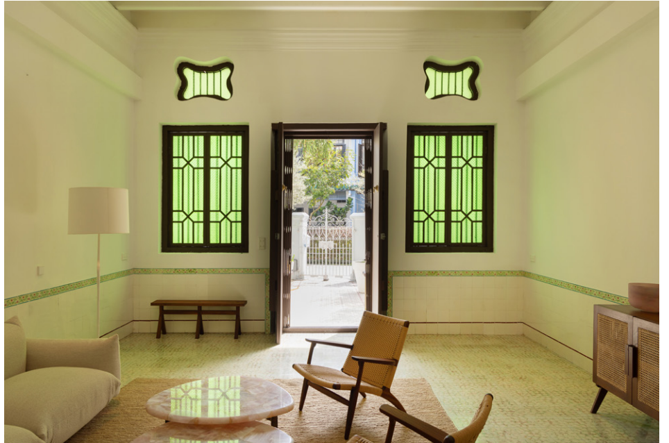
Restored rare artificial marble floor tiles shine alongside vintage furnishings to create a home that seamlessly combines heritage with comfort