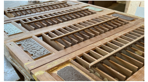
Skilled expertise engaged throughout in the cleaning and repair of original elements such as the plaster and timber work