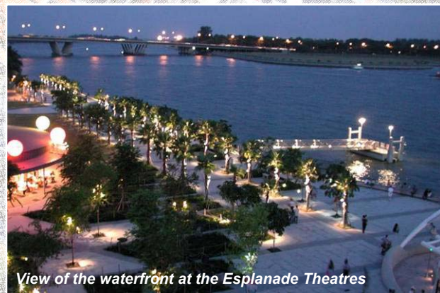
View of the waterfront at the Esplanade Theatres