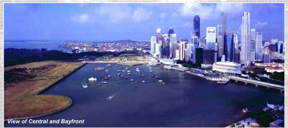
View of Central and Bayfront