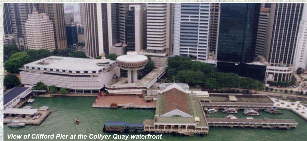
View of Clifford Pier at the Collyer Quay waterfront