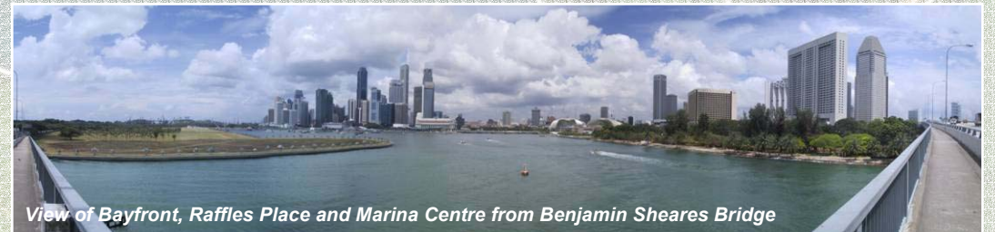
View of Bayfront, Raffles Place and Marina Centre from Benjamin Sheares Bridge