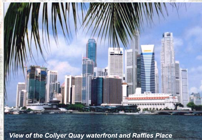
View of the Collyer Quay waterfront and Raffles Place

The area will be connected to the Marina Centre area via a new 280 m long integrated pedestrian-cum-vehicular bridge that will complete the 3.35 km 'loop' around Marina Bay. The bridge will be raised at least 5 m above the adjacent platform level of the waterfront area and 8 m above the future stabilised water level to allow for the passage of boats below.