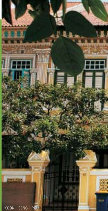
KOON SENG ROAD

The very mention of the name Katong evokes a warm nostalgia, especially among the older generation of Singaporeans. Even today, the area continues to weave a spell over Singapore's psyche. In the 1930s, the island's wealthy would retreat to its version of the Riviera and spend weekends in their bungalows along the beach. Today, as other areas plunge headlong into their quest to modernise and throw up gleaming condominiums, Katong has