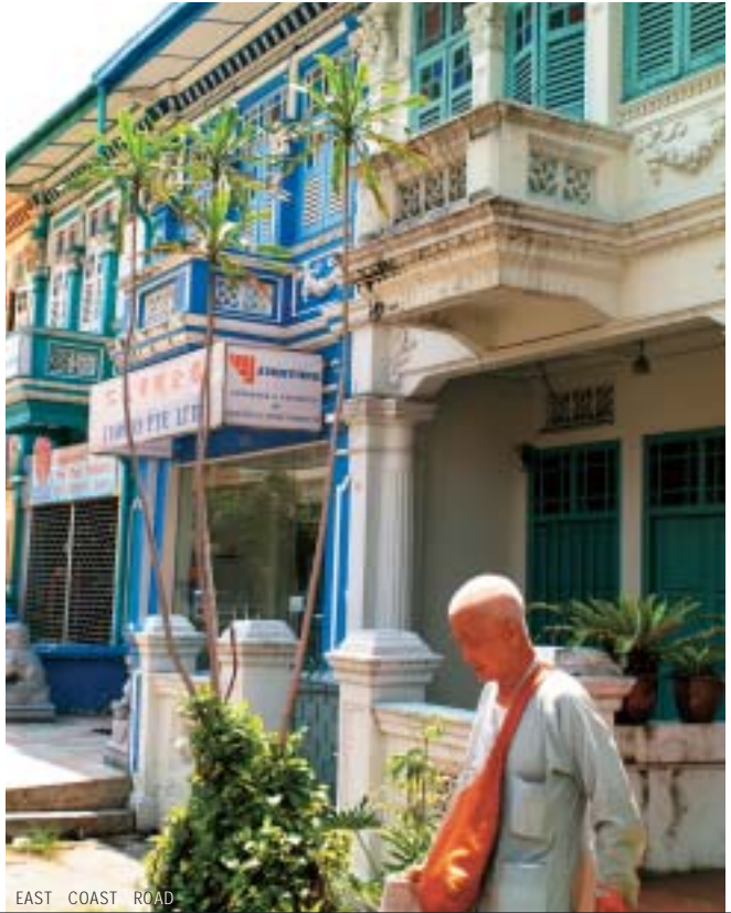
EAST COAST ROAD

For a sample of how the wealthy used to live, drop by the Tan Sen Boh Bungalow (16 Ceylon Road), a grand old mansion, now somewhat dilapidated, but still recalling a more genteel era. While you're on Ceylon Road, take in the performances at the Indian temple Sri Senpaga Vinayagar at No. 19 or indulge in a respite from the heat at the Spanish-inspired St Hilda's Church at No. 41.