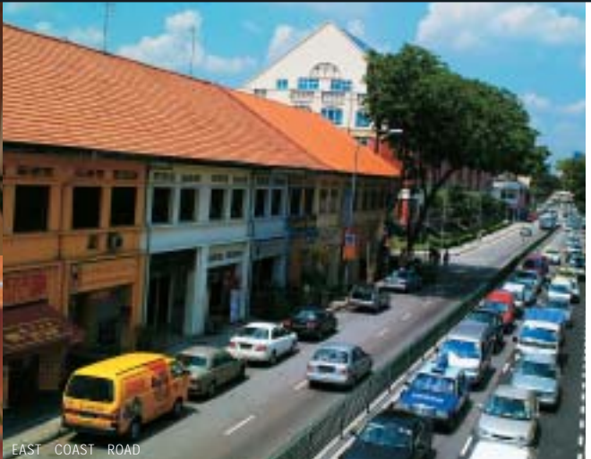
EAST COAST ROAD