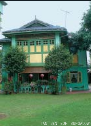
TAN SEN BOH BUNGALOW