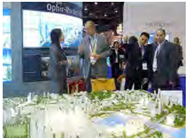
Potential investors being briefed at Cityscape Dubai 2008

Singaporeans living, studying or working overseas were also not forgotten. In October 2008 and April 2009, URA participated in the Singapore Day in Melbourne and London respectively, to share URA's exciting plans for Singapore with Singaporeans living overseas.