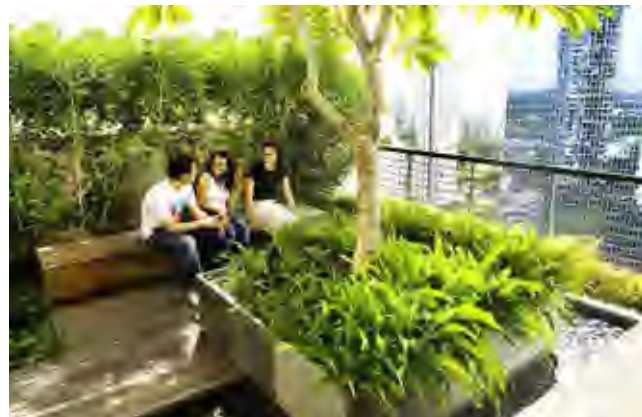
Sky terrace at Newton Suites