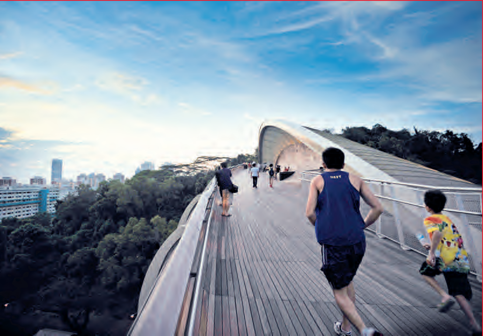
The Southern Ridges attracts an average of 35,000 visitors every month