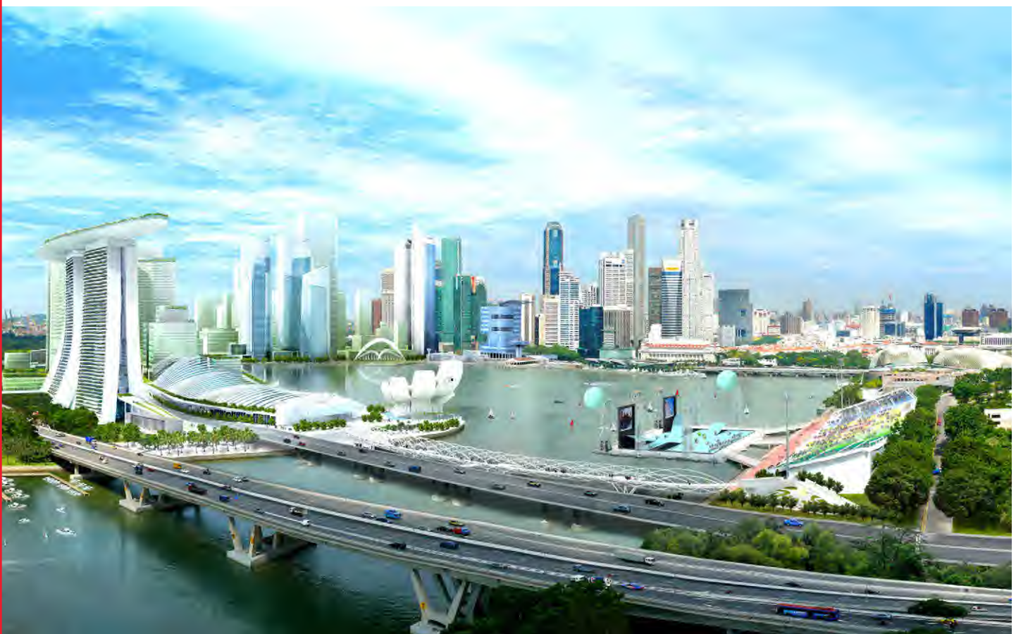
Exciting urban transformation at Marina Bay

A key highlight is the creation of a first ever 150 km Round-Island Route that will enable people to eventually cycle, jog, or walk around the whole island, giving new meaning to Singapore's reputation as a City in a Garden. The route will offer a diversity of experiences through Singapore's many natural gems, from nature retreats to breathtaking waterfront views, beautiful beaches and attractive parks.