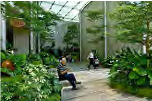
First storey communal landscape area at OCBC Centre