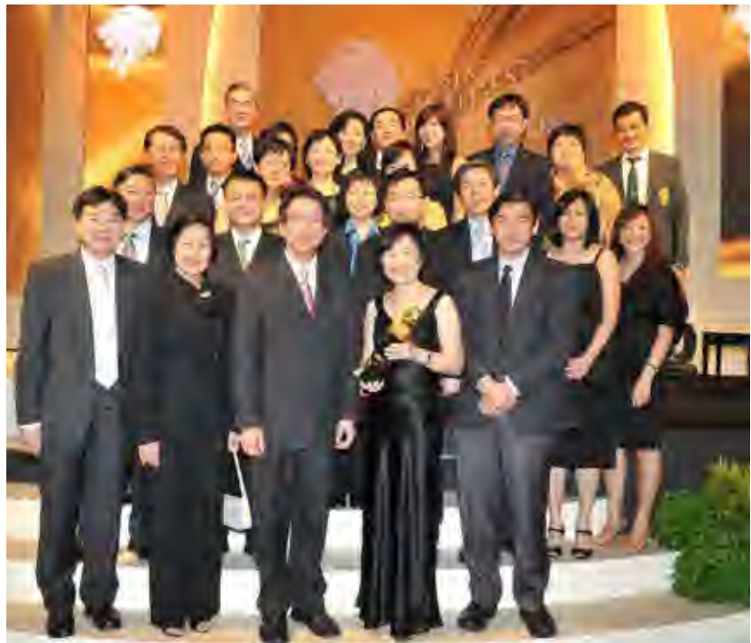
The URA team with Minister (Prime Minister's office) Lim Swee Say at the Business Excellence Awards Presentation 2008, after receiving the Singapore Quality Award