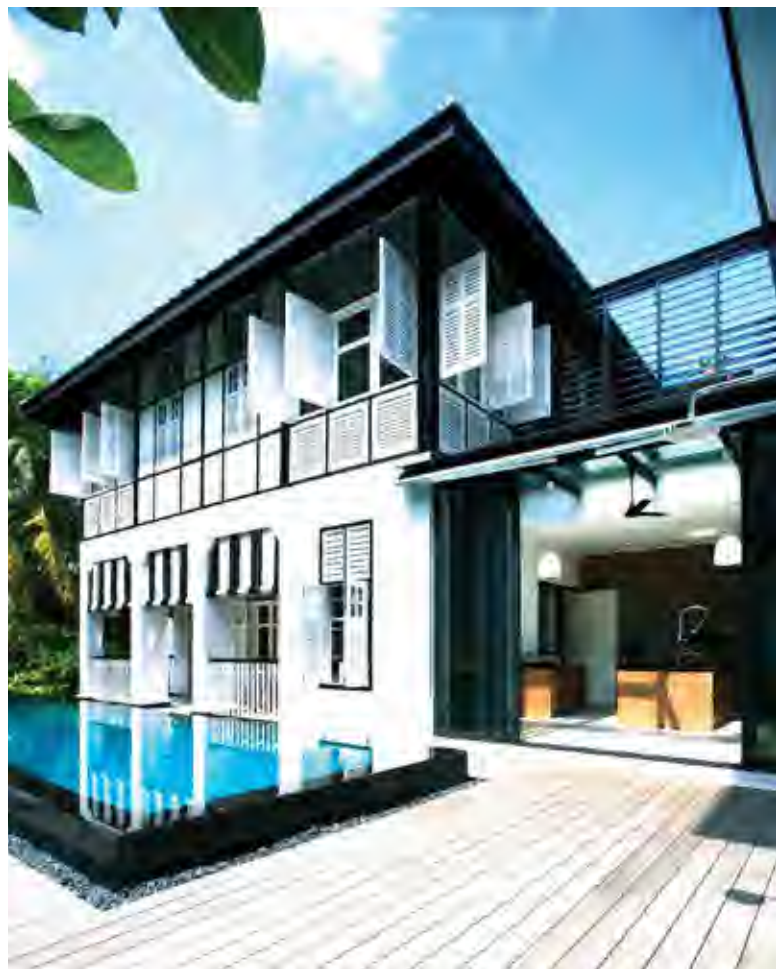
No. 14 Cable Road was one of the AHA 2008 winners - a black and white beauty that was reinvented as a contemporary home

Seven conservation projects were also recognised at the URA Architectural Heritage Awards (AHA) in October 2008. Introduced in 1995, the AHA has been an important platform to recognise building owners, professionals and contractors who have restored or conserved buildings in a sensitive manner.