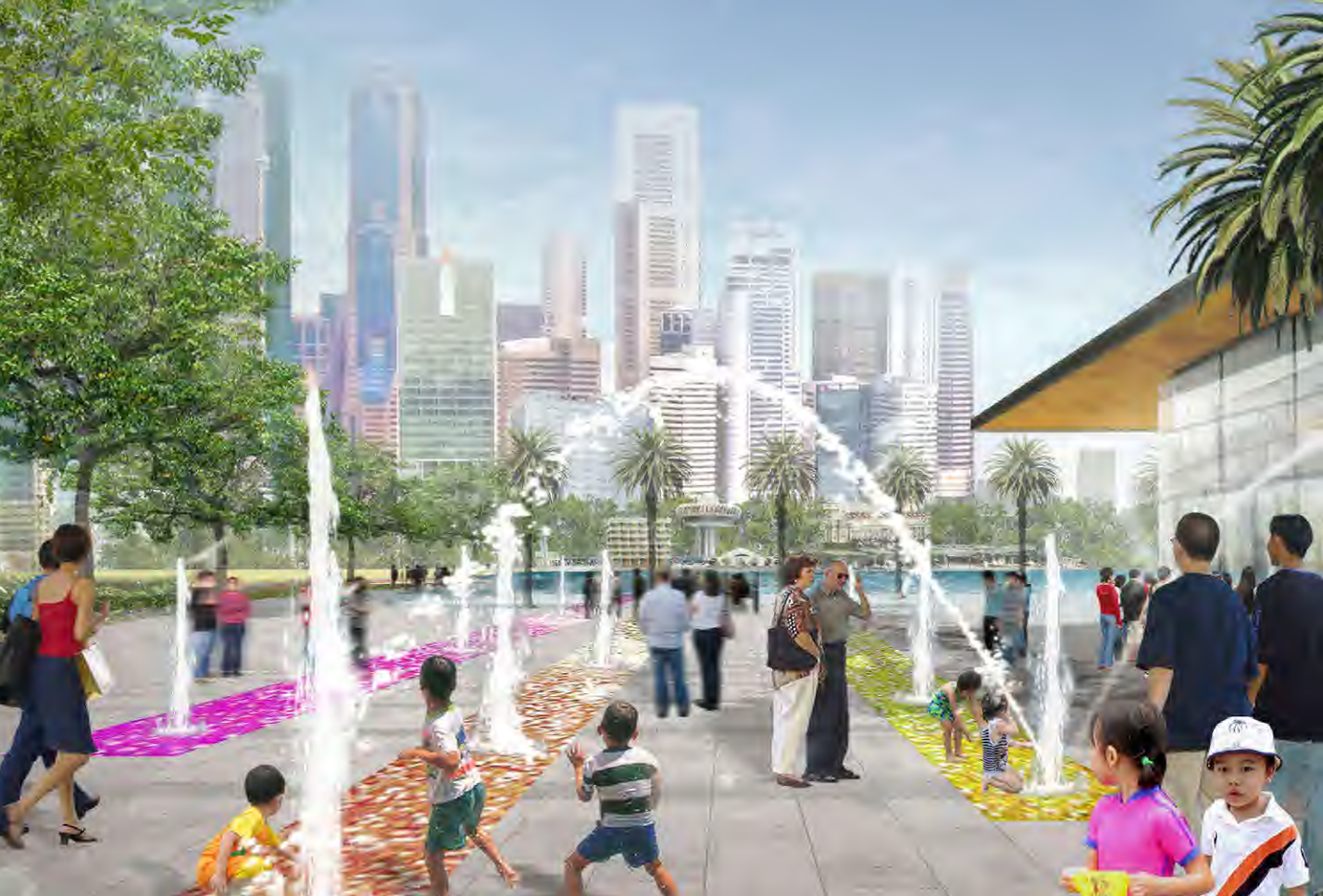
A family-oriented spot with dancing water jets for all to enjoy at the Bay