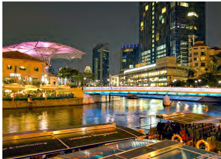
The Singapore River lighted up to bedazzle visitors

The multi-agency committee also initiated Singapore’s first Night Festival in July 2008. Organised by the National Heritage Board, the night scene at the Bras Basah, Bugis area was enlivened with outdoor events such as aerial shows, live music concerts and street theatre. Close to 65,000 visitors partied the night away at the festival.