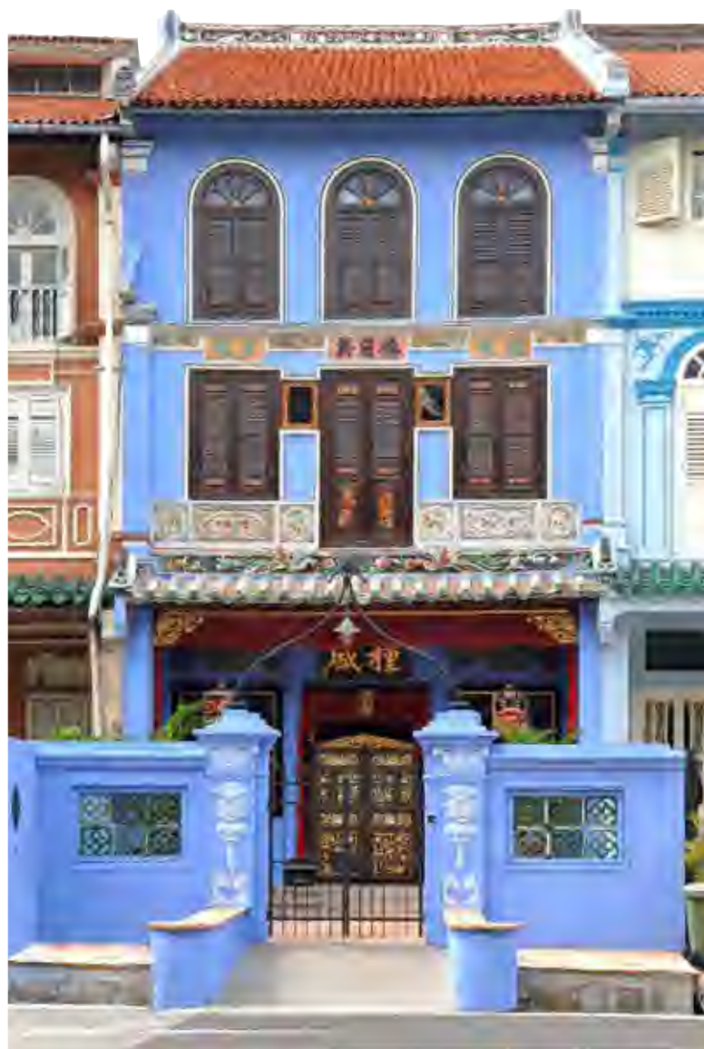
The Baba House at No.157 Neil Road was restored to its former Straits-Chinese architectural glory through URA's joint effort with the National University of Singapore