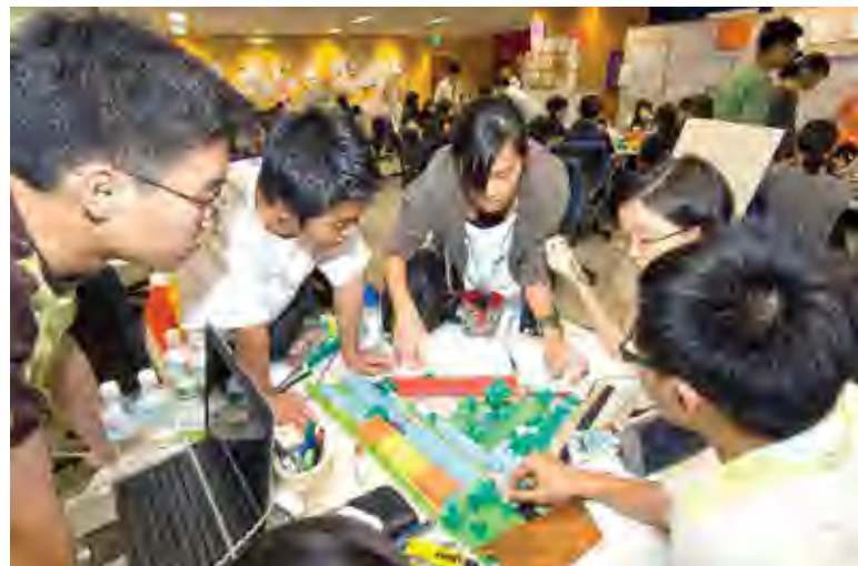
The CUBE participants were teeming with ideas to help transform Chinatown into their dream street

URA launched an urban planning and design workshop-competition for students to create more awareness of Singapore's built environment, understand the dynamics of land use and urban planning, and also stir interest among the young generation into becoming the planners and architects of the future. In the first ever Challenge for the Urban & Built Environment (CUBE) organised in March 2009, about 100 junior college and polytechnic students had a firsthand experience of planning 'out of the box' while learning about