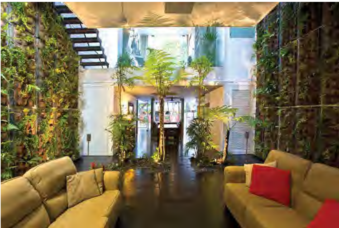
The bold and innovative No. 19 Jalan Elok was the President's Design Award 2008 Winner for Design of the Year