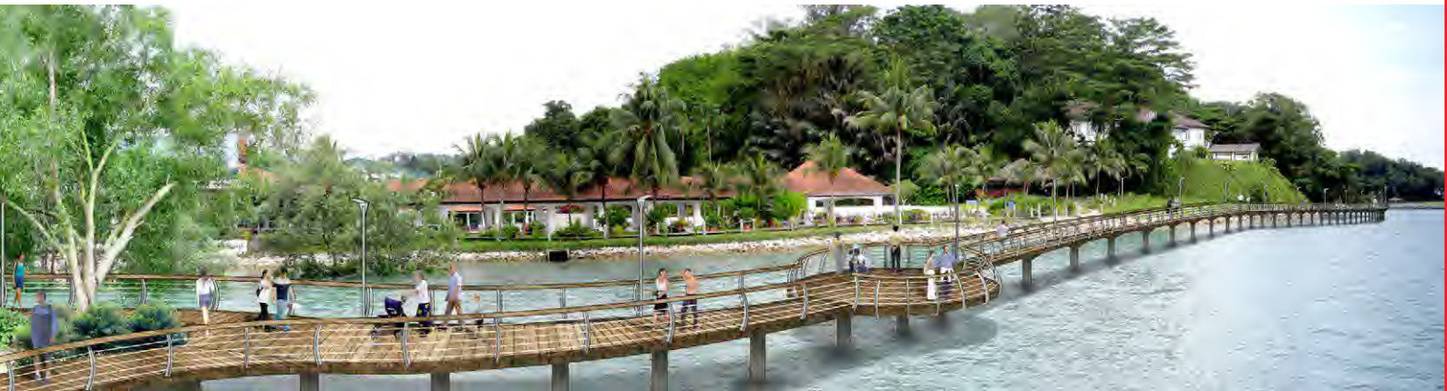
Artist's impression of the elevated board walk at the Labrador Nature and Coastal Walk

A key link of the Round-Island Route is the Southern Ridges, a 9 km chain of green, open spaces spanning the rolling hills of Mount Faber Park, Telok Blangah Hill Park and Kent Ridge Park before ending at West Coast Park.