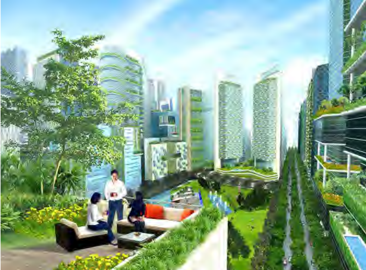
Marina Bay Station with skyrise greenery