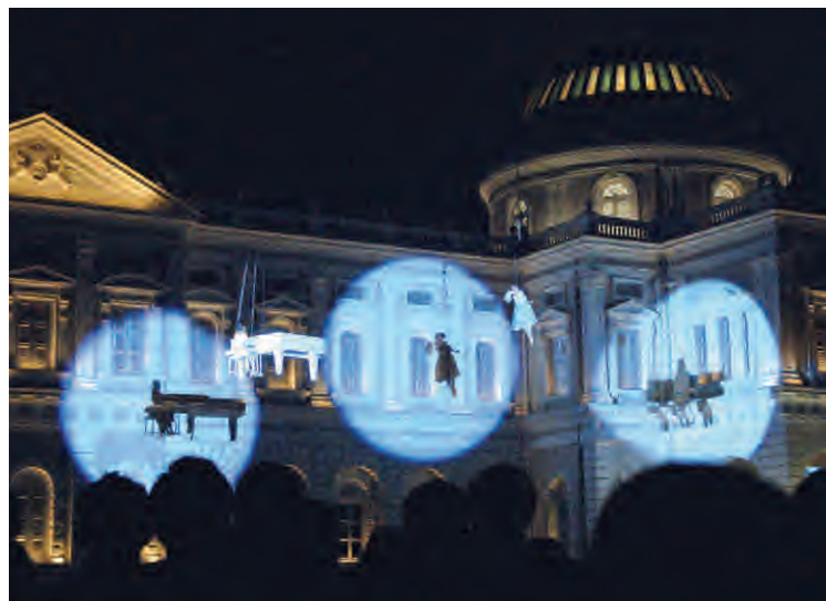
Singapore’s first Night Festival at Bras Basah, Bugis