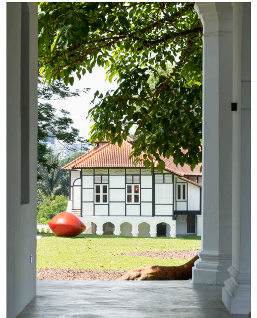
Visual connection maintained between buildings