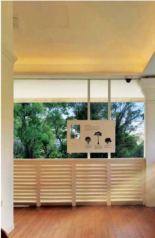
Interpretative frames to explain site