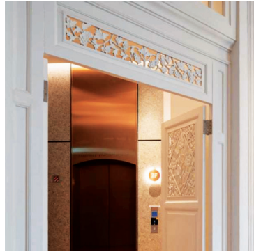
Delicate Asian timber carving