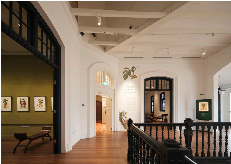
Right-sizing of new programme allows for original layout to be retained