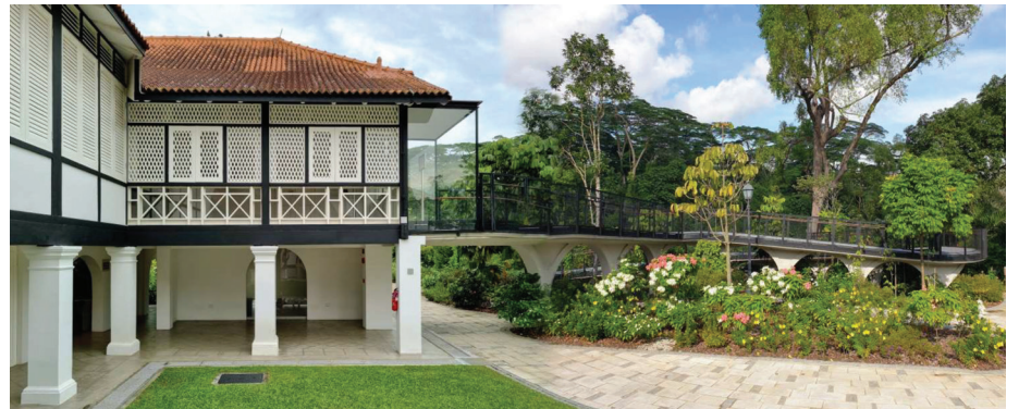
A delicate new entrance ramp added at the rear of Atbara provides universal access and maintains the visual integrity of the building's historic front