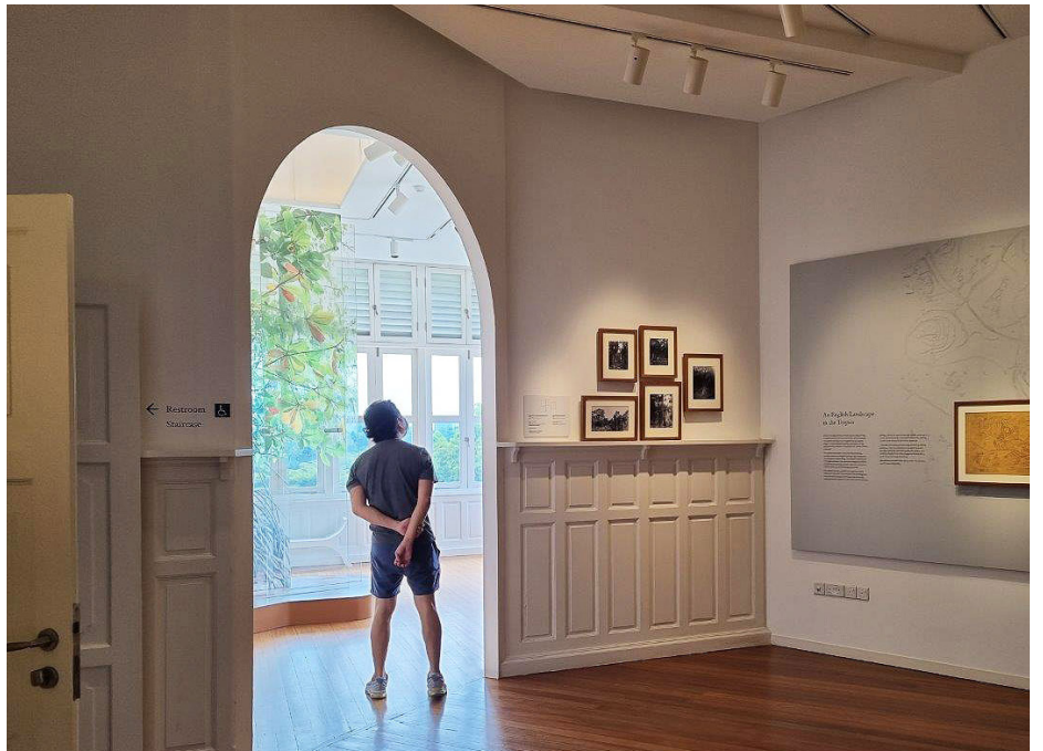
Heritage of the houses and site is sensitively presented