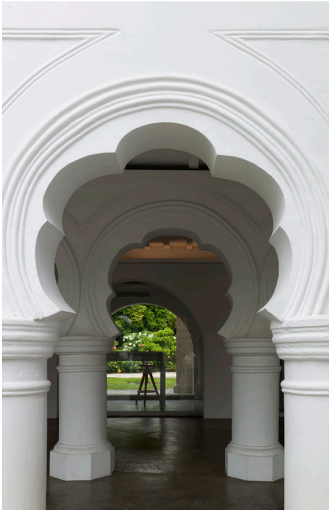
Atbara's distinctive arches restored