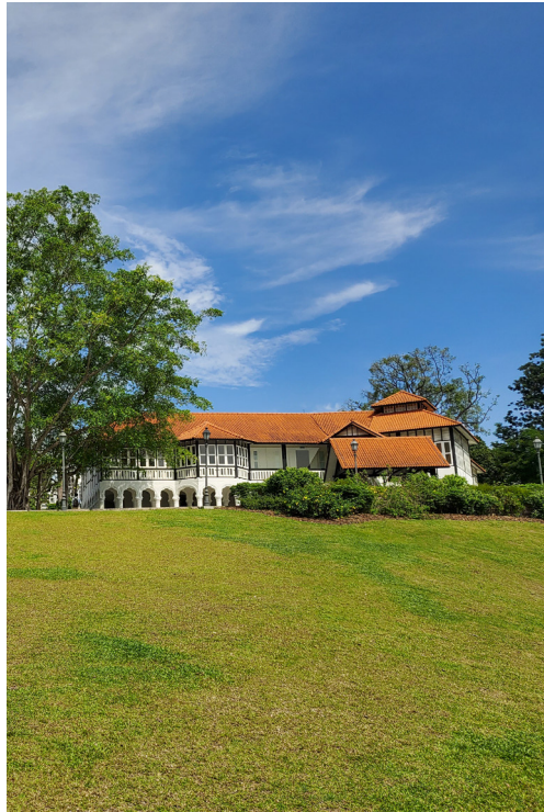
Landscaping enhances prominence of house