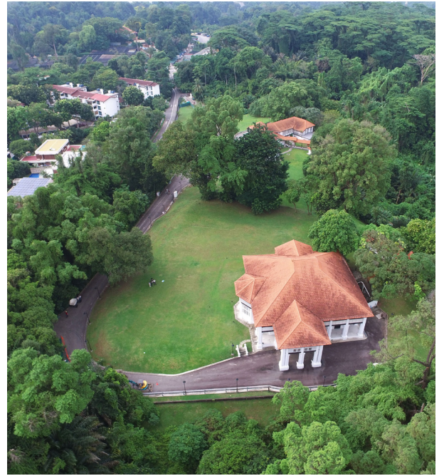
Above and Below: a careful study of the relationship between the buildings, terrain, landscape and planting to guided the integrated approach to conservation