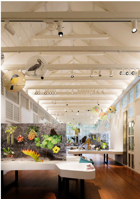
Ceilings opened up for a spacious feeling