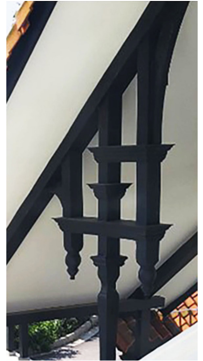
Finely carved timberwork