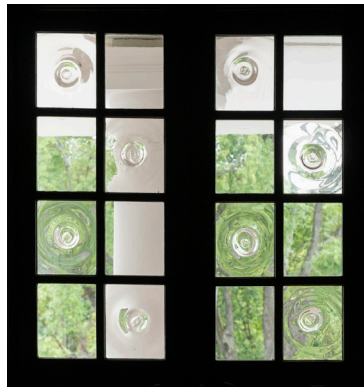
Rare 'Rondel' Glass