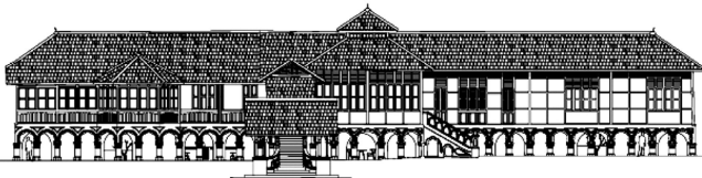
Atbara, 5 Gallop Road