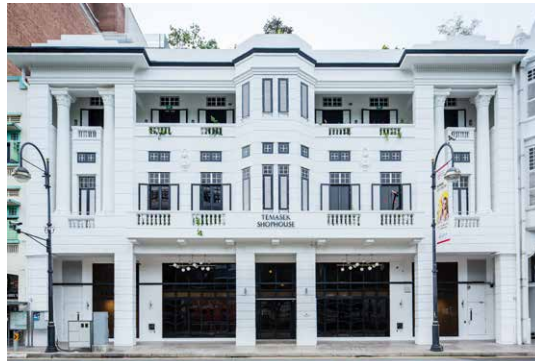
Townhouse along Orchard Road refreshed

Internally, openable windows make it possible for the building to function with natural ventilation. Complementing these, the project team has introduced new environmentally sensitive technology such as a ducted evaporative cooling system.