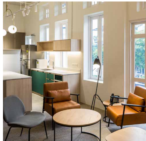
Enhanced quality of natural light