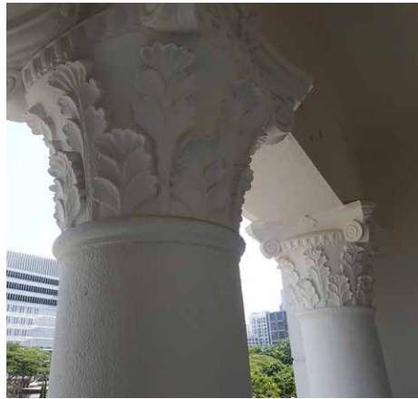
Capital of Corinthian columns