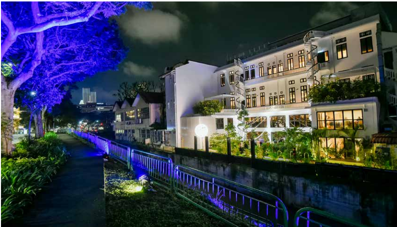
Rear facade rejuvenated to connect to streetscape