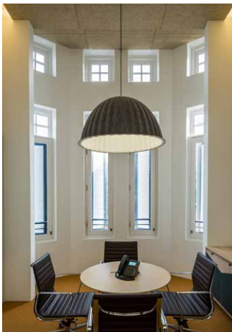
Double volume space reinstated to expose fanlights