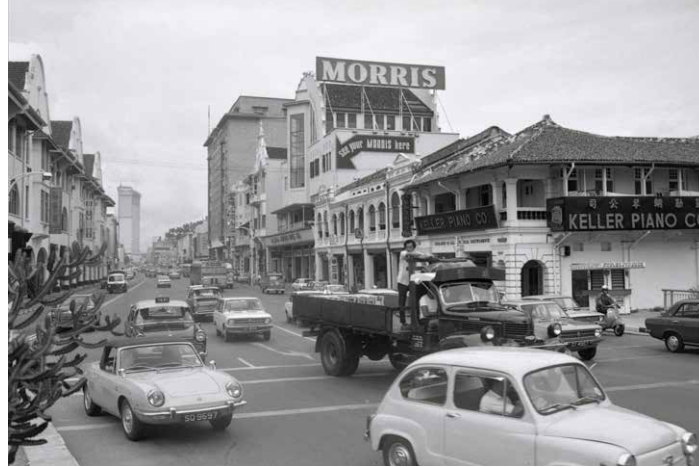
View of Dhoby Ghaut (now Orchard Road), 1971

Opened up as plantations, Orchard Road used to nestle in a valley flanked by hills such as Cairnhill, Emerald Hill and Fort Canning Hill. It has witnessed many significant developments in Singapore's history and development. Today, it is an established retail belt which has won international acclaim over the years.