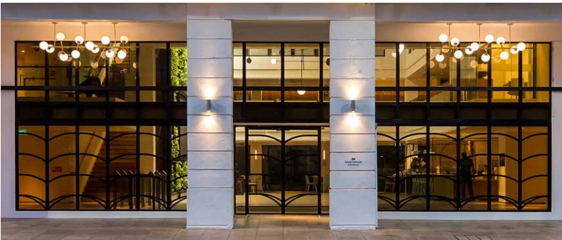
Double volume entrance reinstated and opened up