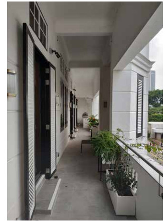
Verandahs offer new vistas of Orchard Road