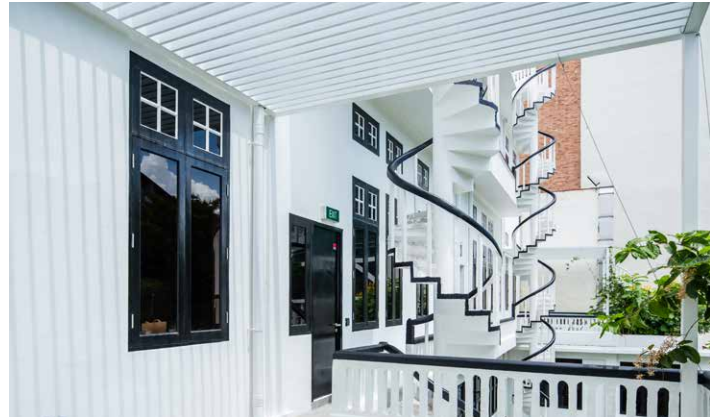
Removal of rear enclosure exposes spiral staircases and open verandahs