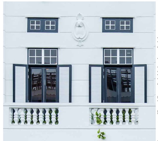
Timber windows and plasterwork restored