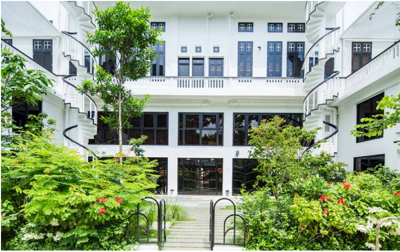
Landscaping supports local biodiversity