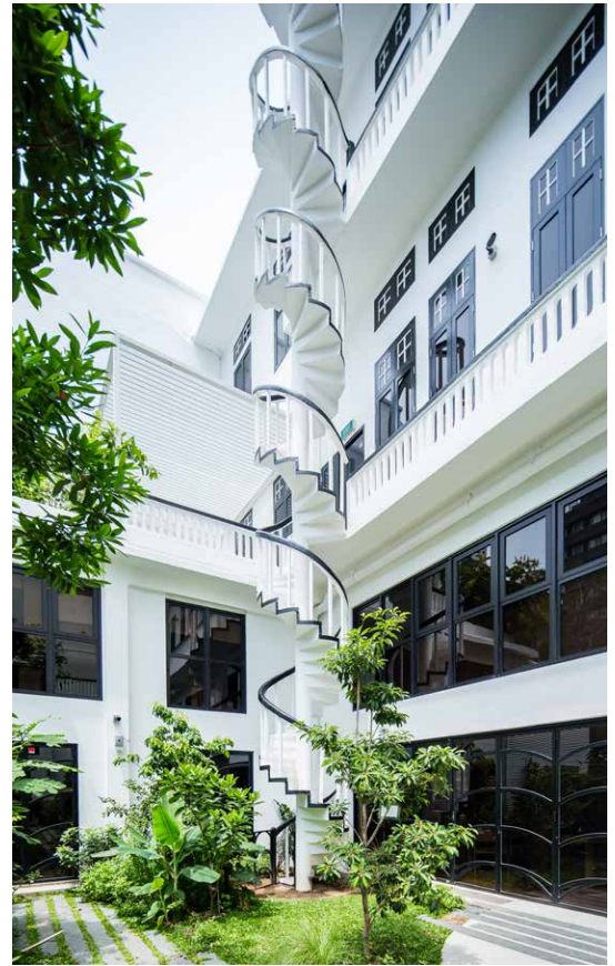
Original spiral staircase