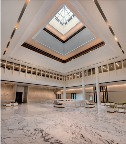
Spatial qualities of atrium restored