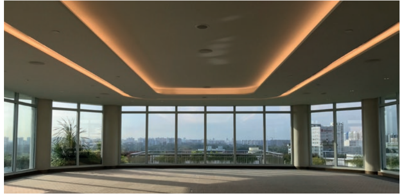
Historic Jade Room with view of Jurong