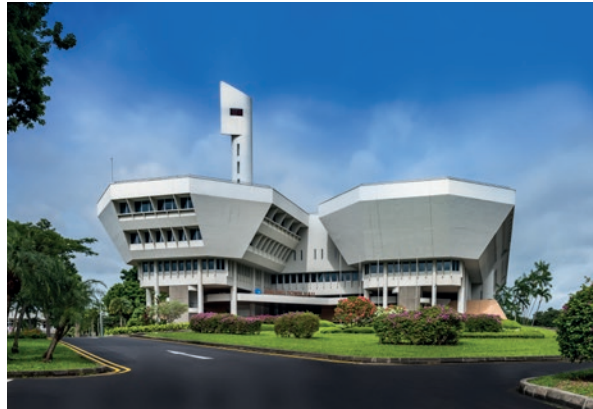
Key landmark of Jurong

G azetted in 2005 for conservation and elevated in 2015 as one of our 'Modern' monuments, the Jurong Town Hall has been a landmark since 1974. This recent restoration has not only rejuvenated the fabric and spaces of the building, its reuse as a hub for trade associations has recovered the spirit of the original design and purpose.