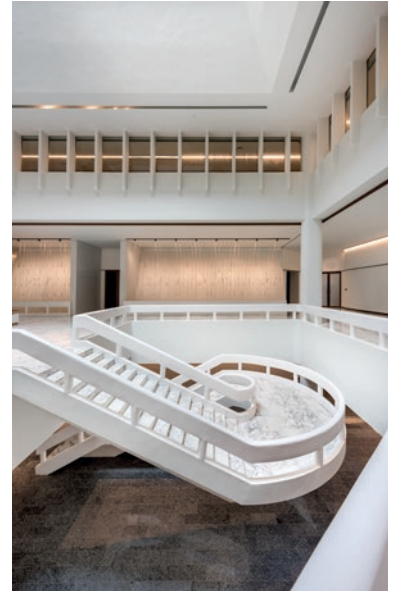
Original atrium staircase retained