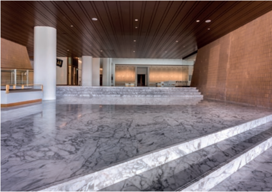
Period appearance of main entrance recovered