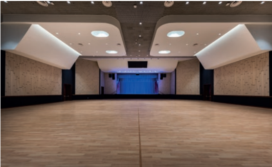
Original look retained in the Auditorium