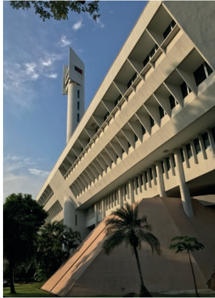
Exterior sensitively refurbished