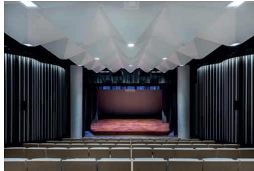
Theatrette with recreated ceiling