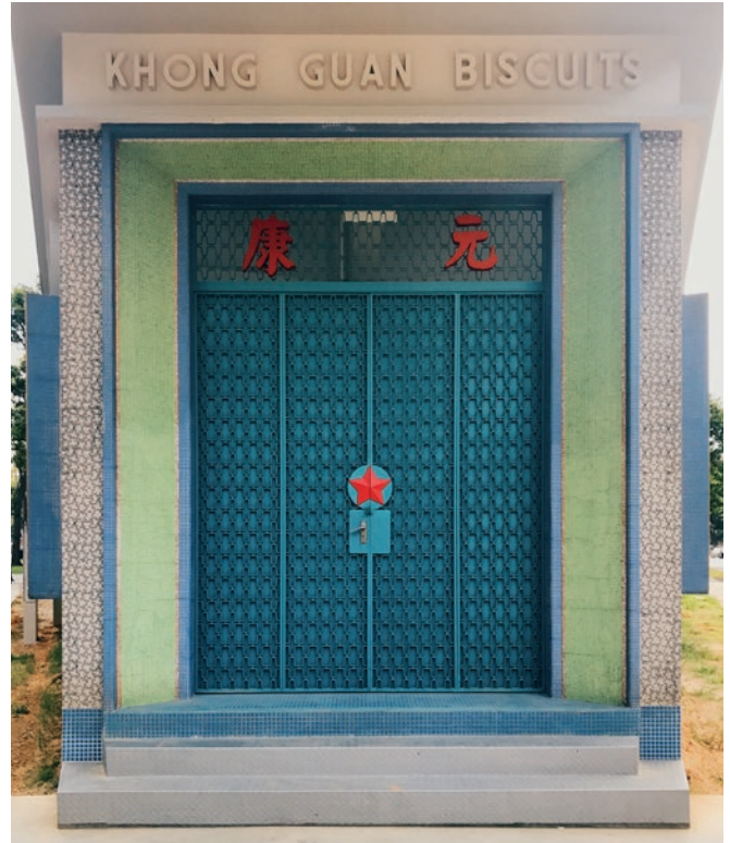
Main doorway with 1950s mosaic tiles and metal-grille gate