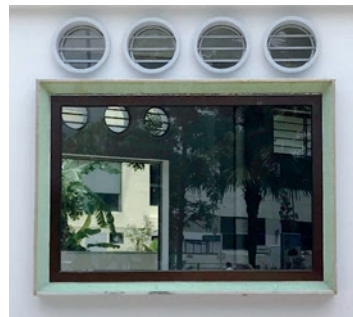
First storey window