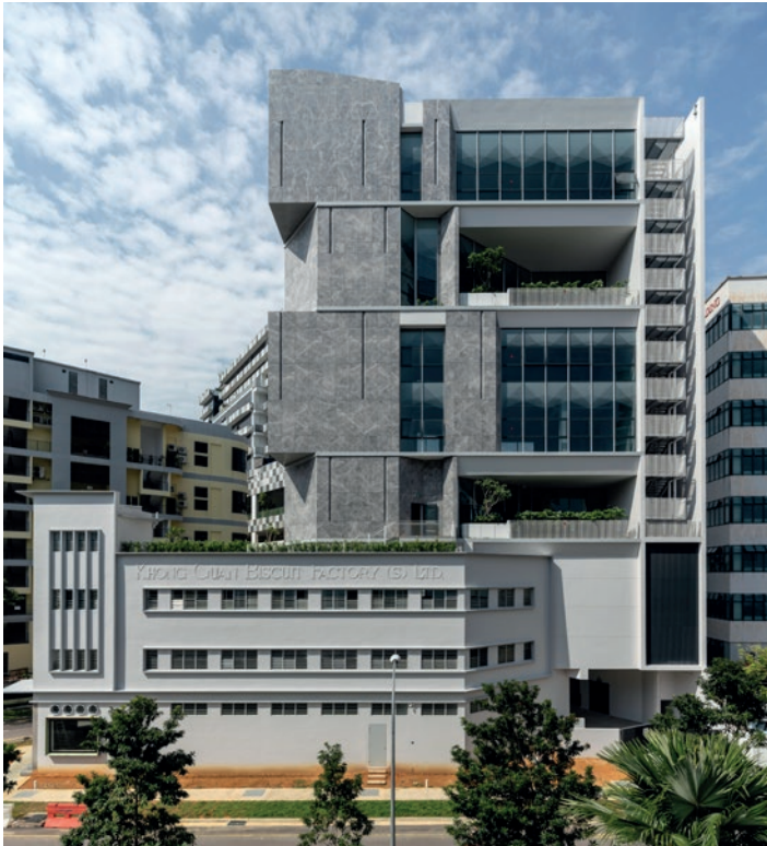
New extension takes reference from the form and massing of the historic building