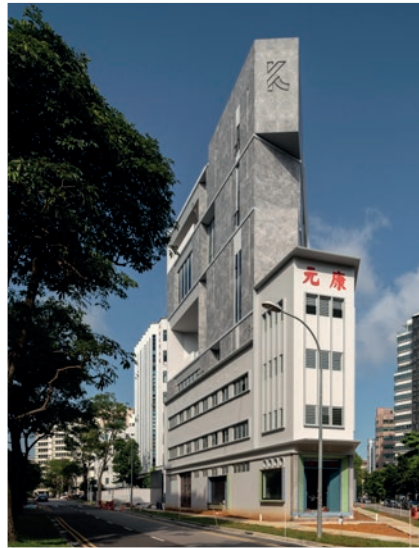
Iconic apex of the Khong Guan Building

Reminders of the past have been carefully retained and integrated as part of the experience of the site. At the side facade, the patinated old warehouse door and side gate are kept and are still in use. Detective work into the missing 'star' logo at the main building gate guided its restoration as a distinctive three-dimensional relief and the original colourful period mosaic tiles were retained. Wired glass and window mechanisms typically used in the 1950s, were specially sourced to recover the period aesthetics of the building. Extra effort was put in to analyse the colour pigment of the old paint layers so that the building could be painted with the original facade colours to create a more complete period atmosphere.