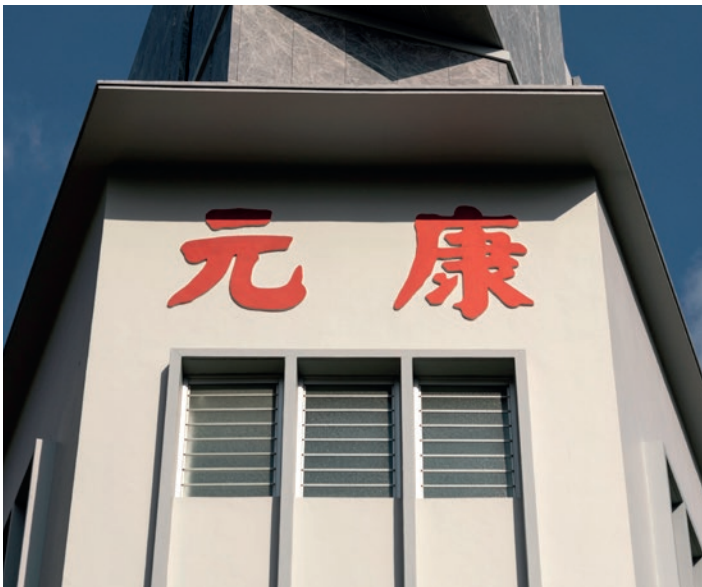
Original plaster characters retained and wired glass loured windows reintroduced