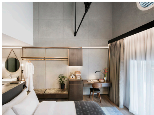
Treatment of interior spaces reminiscent of its industrial past