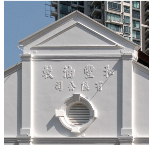
Reinstated signage of Ho Hong Oil Mills