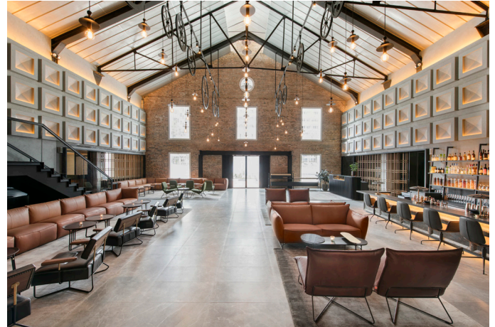
Double volume space retained at the main lobby