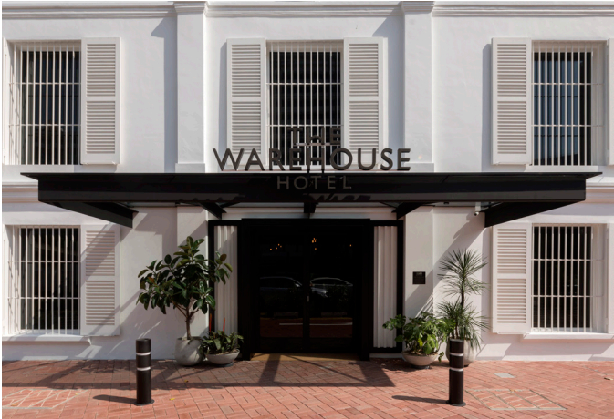
Timber louvred windows and metal security bars retained