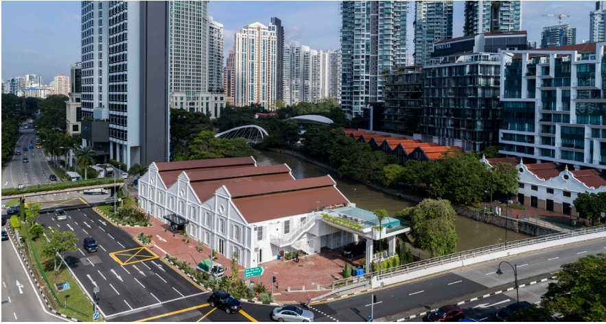
Top view of the warehouse along Singapore River