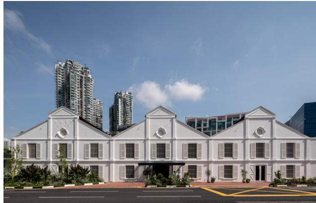
A historical landmark along Havelock Road

The character of the former warehouse has been retained while new interventions sensitively kept the spatial qualities. Original elements such as metal roof trusses were retained and new portal frames discreetly added to bear the new loading requirement for the roof. Jackroofs, a typical feature of warehouses were also retained. To bring natural light into the interior spaces, corrugated glass skylight panels similar in profile to the corrugated metal roof were introduced. Original vertical security bars of the windows were repaired and kept, but with an innovative touch to the frames so that some of the windows can double up as fire escapes.