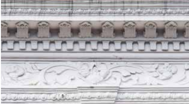
Ornate plaster decorations were restored by hand after chemical analysis was carried out