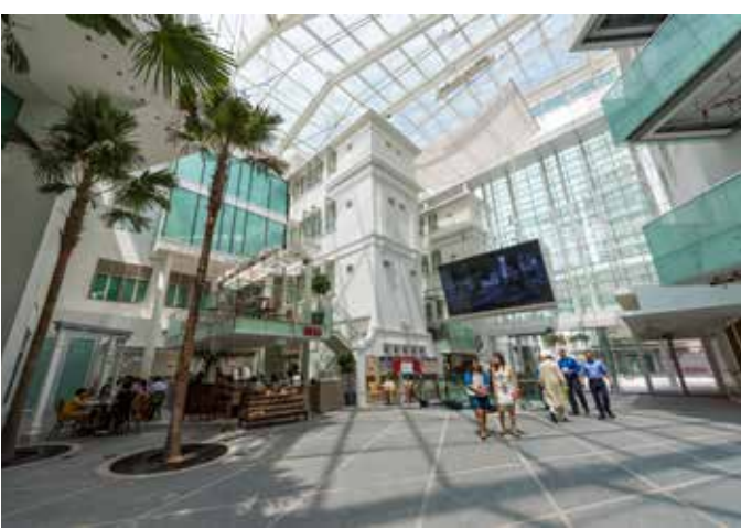
New glazed galleria linking all three buildings, a lively public space created