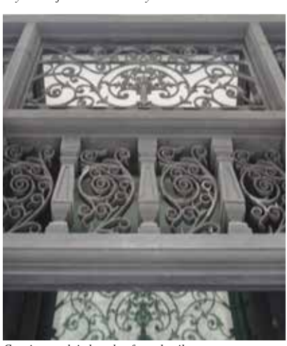
Cast iron and timber shopfront details