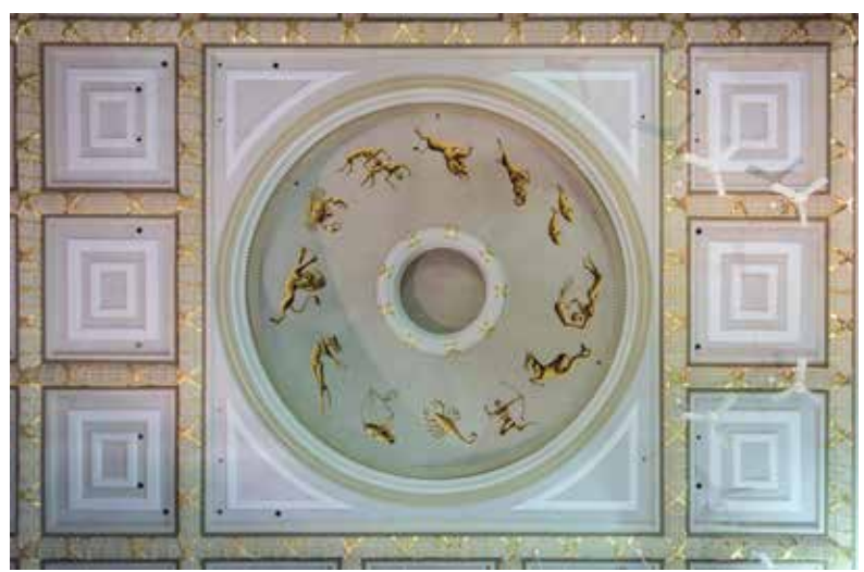
Painstakingly researched and restored ceiling