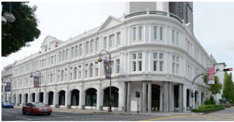
Stamford House returned to its original use as a hotel