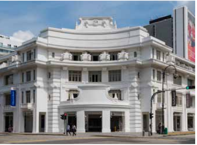
A major urban precinct has been revived through restoration

development project of Capitol Theatre, Capitol Building and Stamford House. One of its many highlights is the interior of the Theatre. Within it, original Art Deco and Neoclassical design nuances from the 1900s to the 1940s have been restored through a combination of technical excellence and artistic skill, with breathtaking results. Delicate work included the reinstatement of missing details and finishes such as original gold gilding on the ceiling grid. This has been painstakingly restored following a historic microscopic paint seriation analysis on the original colour scheme. The team did well by engaging an artist to recreate and capture the spirit of the original Persian Zodiac ceiling mural – a key feature that is deeply lodged in the memory of generations of cinema goers, but which could not be salvaged due to years of neglect and deterioration. Similarly memorable, the pair of 'Pegasus' reliefs at the sides of the stage were delicately cleaned to reveal details long hidden by many coats of paint. Of notable mention