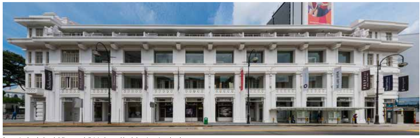
Impressive\ façade\ thoughtfully\ restored.\ Original\ ground\ level\ shopping\ reintroduced