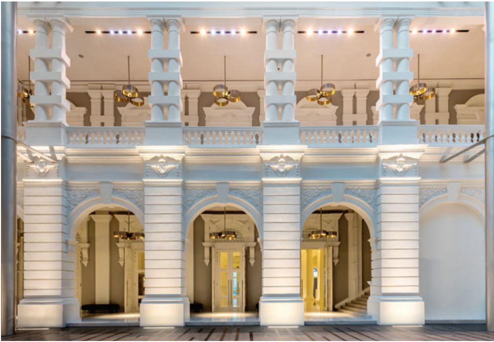
Victoria Concert Hall's atrium façade