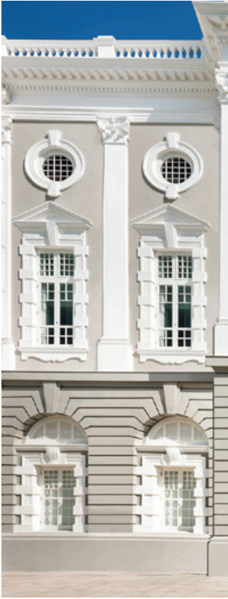
Crisply restored plaster-works on the façade