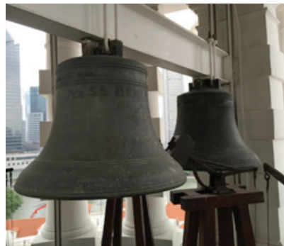
Restored clock tower bells