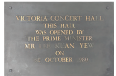
Plaque to commemorate re-opening of Victoria Concert Hall