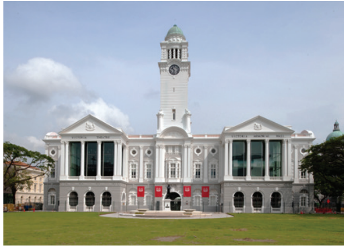
Victoria Theatre, Victoria Concert Hall and Clock Tower regained their prominence

Two monuments built at different times for distinct purposes, Victoria Theatre (circa 1862) and Victoria Concert Hall (circa 1905) have been elegantly rejuvenated with great skill and conceptual finesse. Taken together, restoration and improvements to the buildings have made these major cultural and architectural landmarks newly relevant and resplendent, adding to their aura of Neo-Classical grace and grandeur.