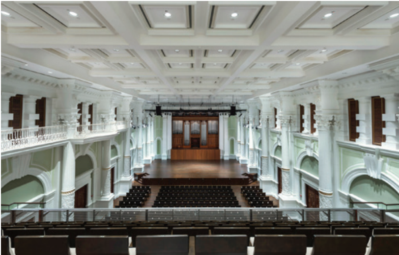
Restored and refreshed interior of Victoria Concert Hall