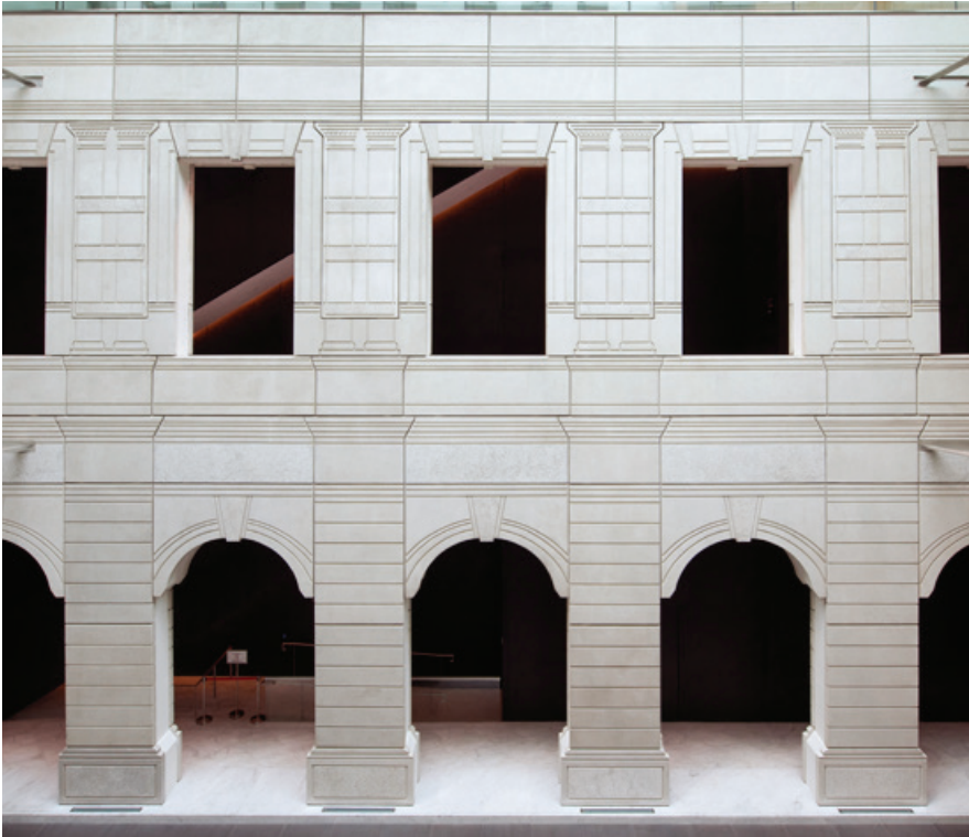
Sensitive reinterpretation of Victoria Theatre's atrium façade