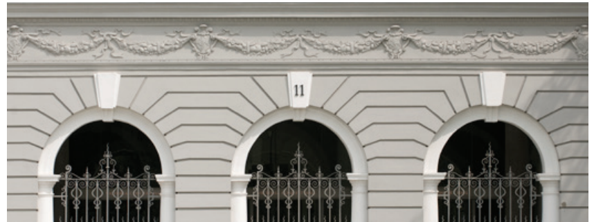
Festoons, plaster and wrought iron-work at front porch