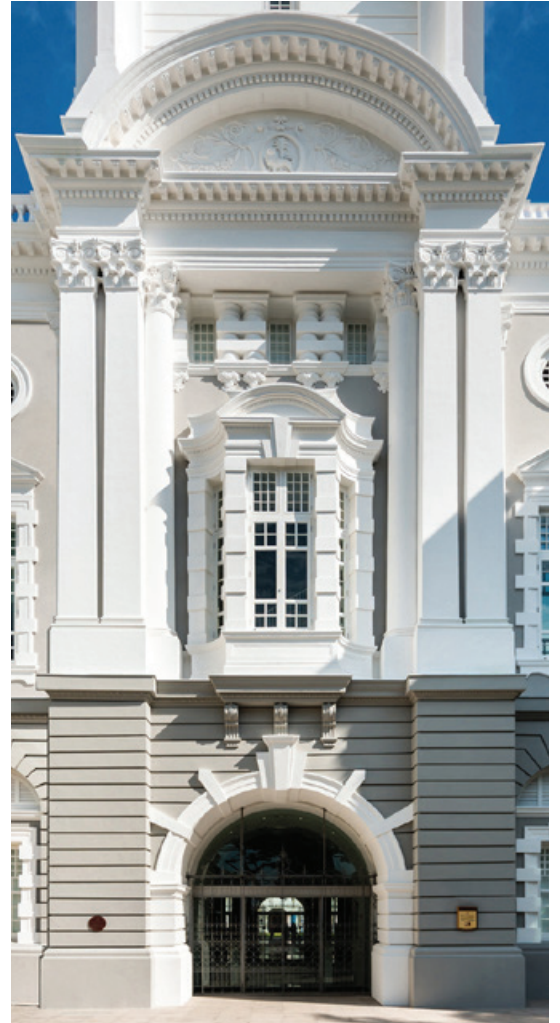
Main entrance to central atrium