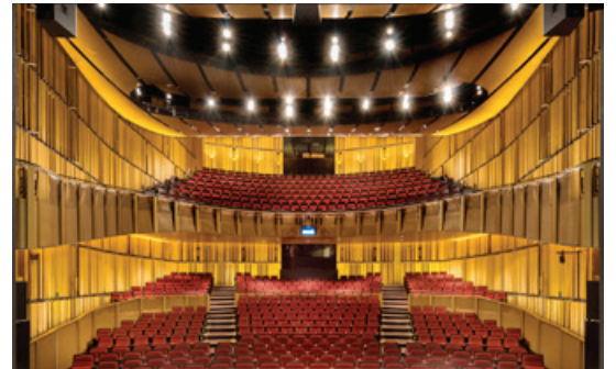
Reinterpreted interior of Victoria Theatre