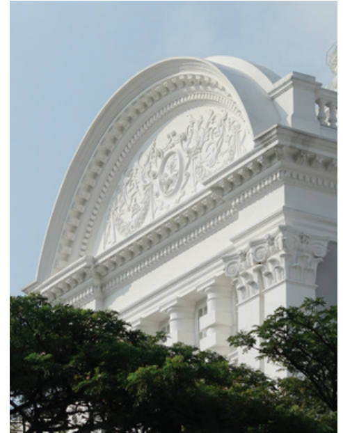
Tympanum with elaborate plaster-work wreaths and crest of the Colony of Singapore