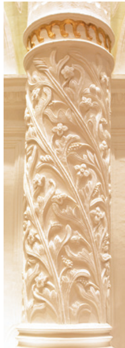
Column of Victoria Concert Hall