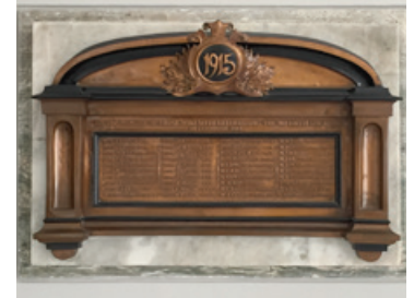
1915 Singapore Mutiny memorial plaque