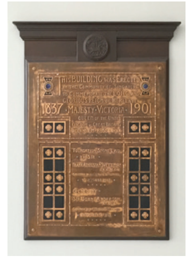
Foundation plaque from 9 August 1902