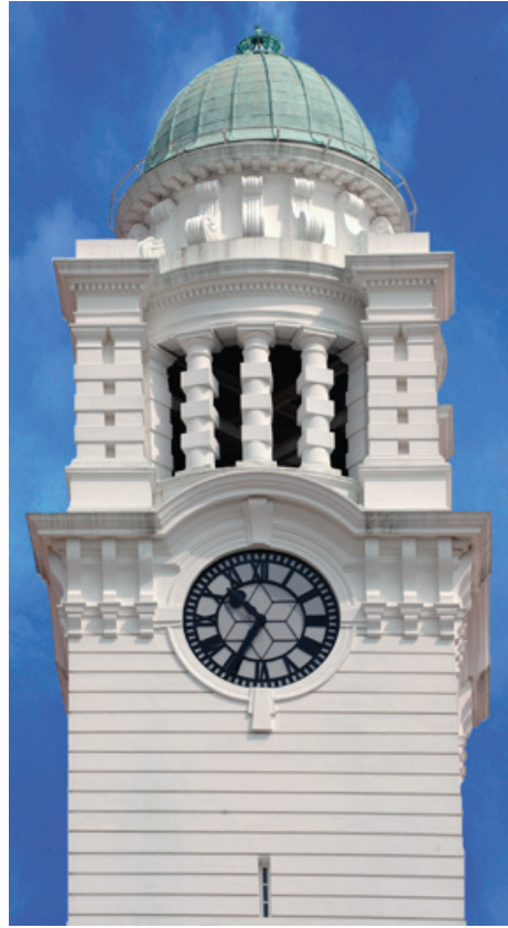
Crown modelled after original reinstated above copper dome