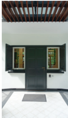
Damaged timber doors and windows reinstated