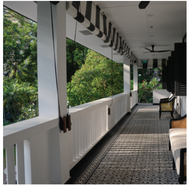
Open verandah typical of a tropical bungalow