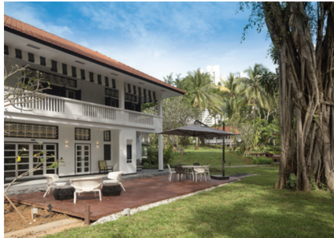
Three colonial bungalows have found new meaning as a training centre

Originally built as residences for British military officers, this set of three colonial black and white beauties, circa 1950s, have been awakened to its new purpose as a modern corporate training retreat. The holistic approach taken has recaptured the nostalgic charm of colonial homestead living, restoring not just the bungalows but also their terrain of landscaped gardens with vistas to discover, and the natural wooded surrounding.