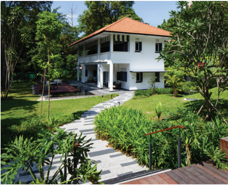
Sensitive integration of the buildings and landscape