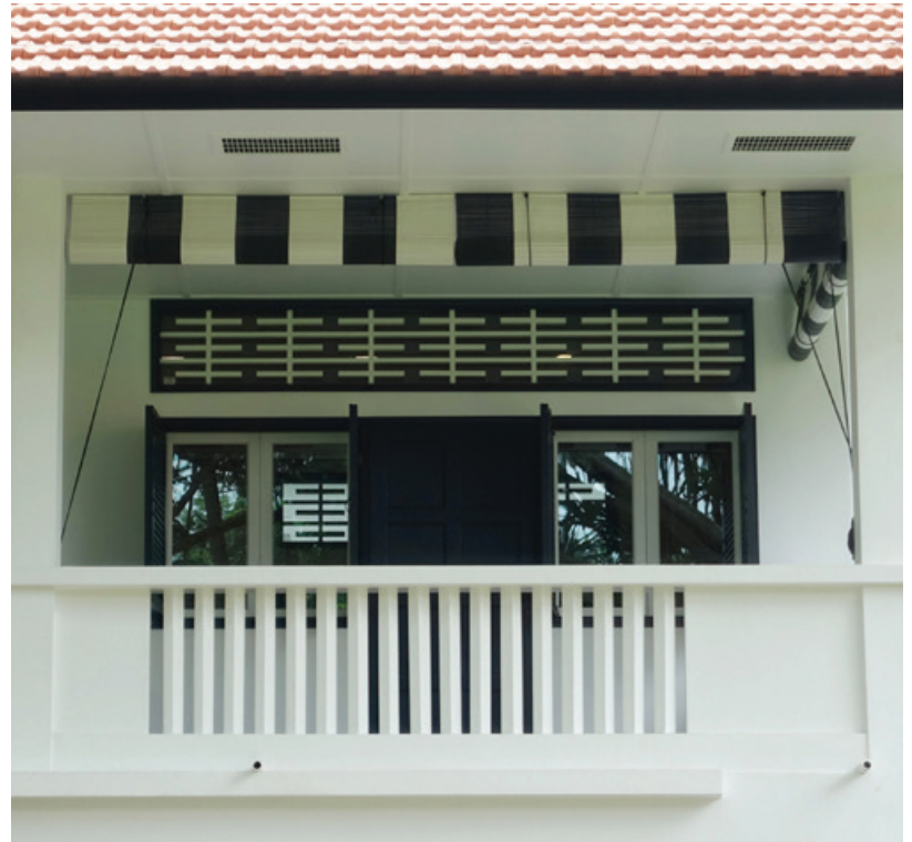
Careful treatment of details at second storey verandah