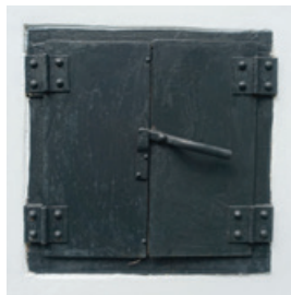
Original chute retained