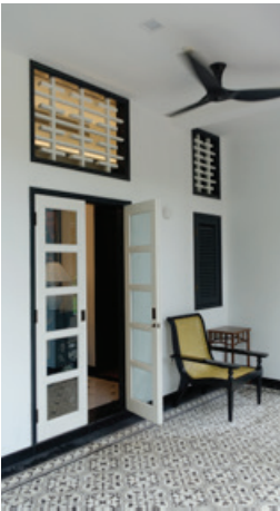
Sensitive selection of finishes