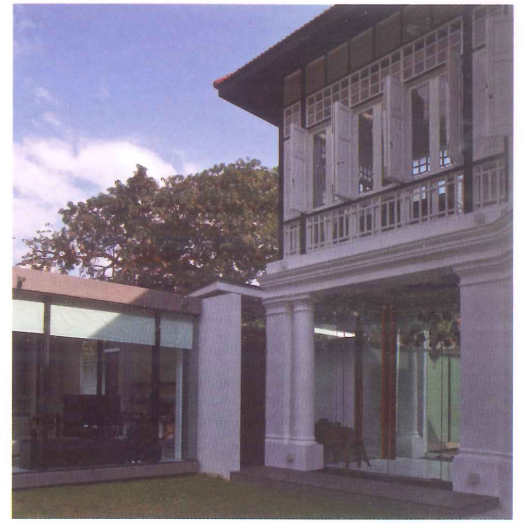
Juxtaposition between old and new which is kept low