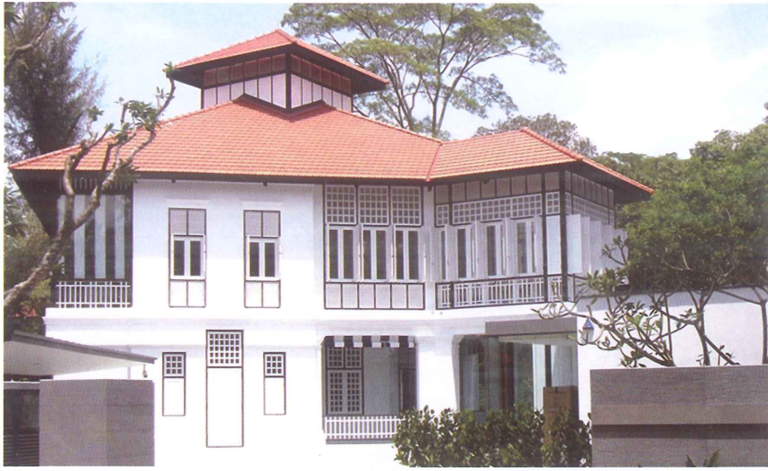
View of bungalow from main entrance