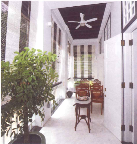
Verandah at first storey