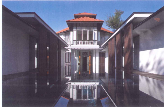
Black-and-white Style bungalow restored with symmetrical wings and linear lap pool