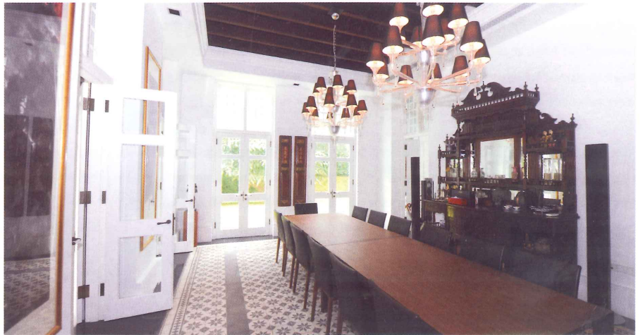
Original full-height timber French doors and exposed timber beams kept