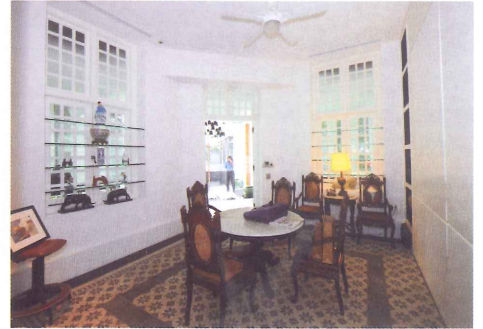
Original patterned floor tiles retained