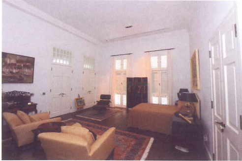
Bedroom at second storey