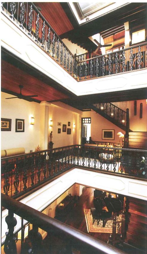
Main stairway with cast iron balusters and open circulation spaces doubling up as display areas