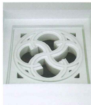
Square vent with concrete infill of original design