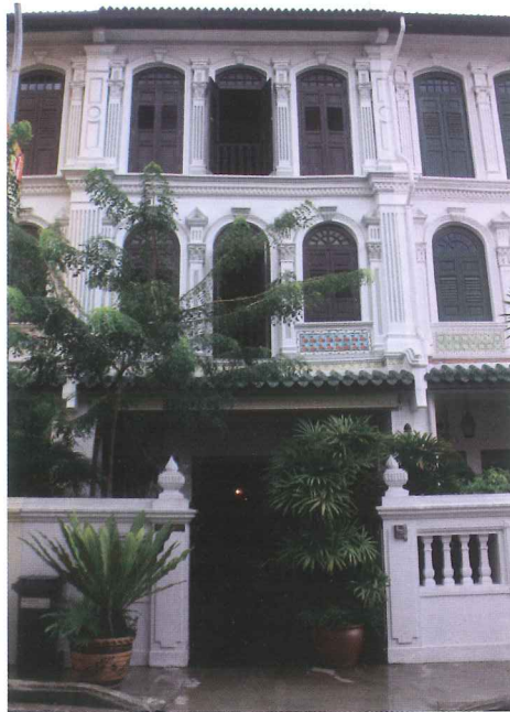
Transitional-style terrace house beautifully restored

With windows and openings mostly restricted to the front and rear of the house, the revitalised open-air courtyard space acts as the pillar of light illuminating all levels of the home while providing healthy cross-ventilation. The surrounding living spaces gravitate towards the light