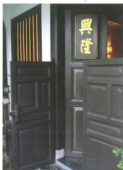
Pintu pagar fitting main door with customised timber latch lock