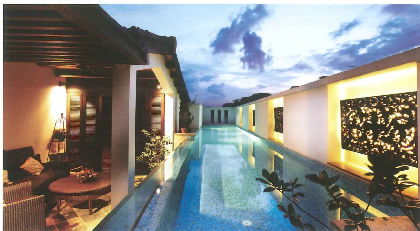
Swimming pool over rear courtyard