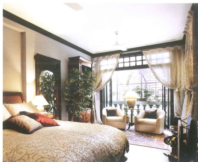
Bedroom at upper storey