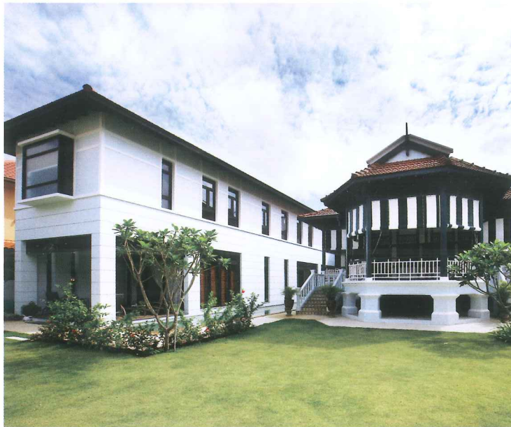
Traditional bungalow resuscitated through sensitive and careful restoration

Another outstanding characteristic of the house is its polygonal open-verandah that overlooks the front yard. The owners made a worthy decision to keep the unusual patterned, coloured cork flooring at the