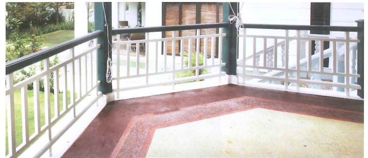
Polygonal open verandah with unusual patterned coloured cork flooring