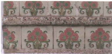
'Peranakan' glazed tiled risers