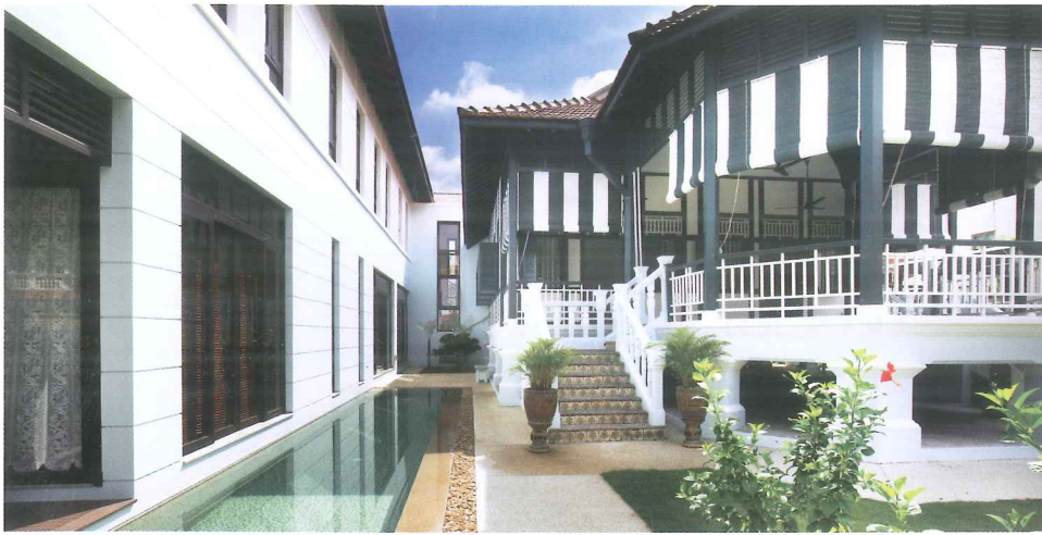
Lap pool and courtyard between old and new development