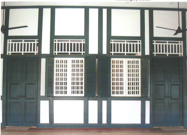
Internal patterned doors and lattice windows