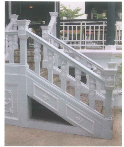
Staircase with decorative mouldings and balusters