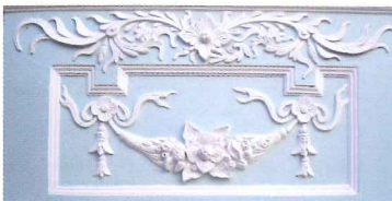
Intricate carved mouldings