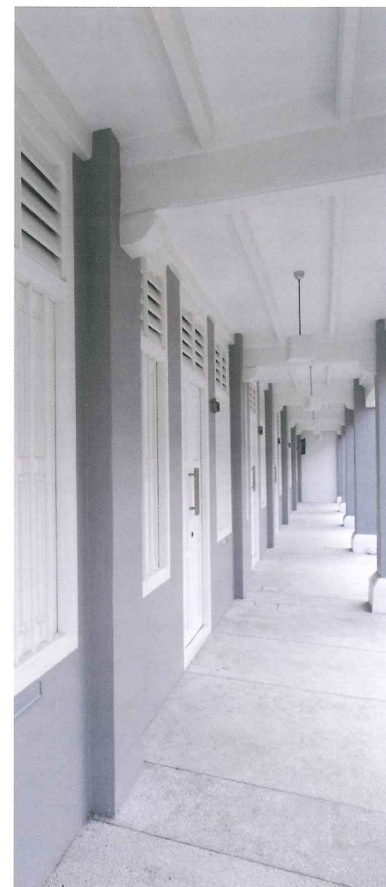
Five-foot way with specially created joint lines