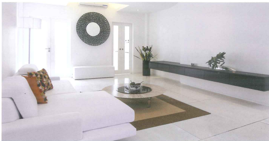
Living area of corner unit