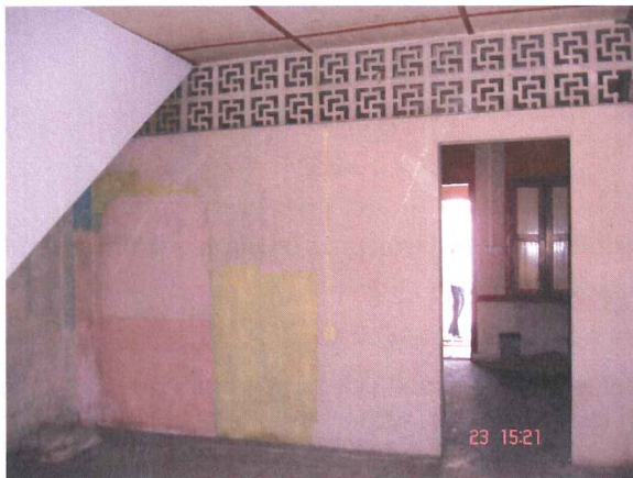
Living room on first storey