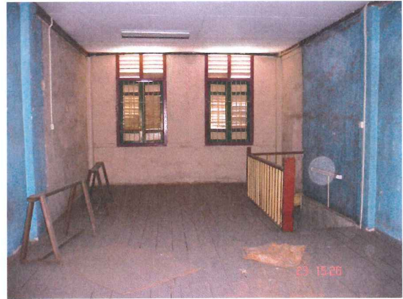
Bedroom on second storey