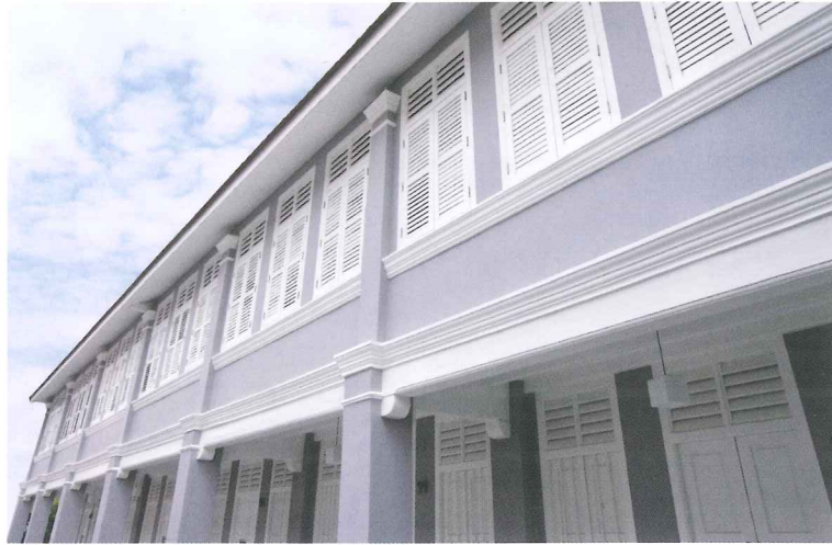
Six restored double-storey transitional shophouses

The façade of this row of six revitalised beauties now stand tall as a strong reminder of the past. Rotted beyond repair due to chronic termite infestation, the original double casement windows and front doors of all six units were painstakingly renewed to life with great precision in form and proportion. The characteristic shophouse “five-foot way” was also reinstated. The natural clay-coloured roof tiles were laid to the original pitch and height, while jackroofs were fitted in for an unhindered flow of natural sunlight into the units.