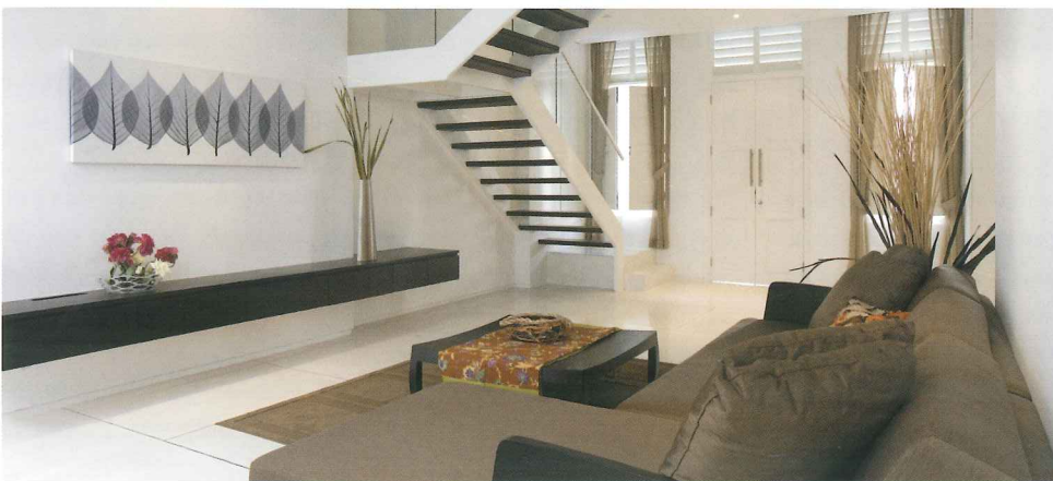
Intermediate unit with linear staircase