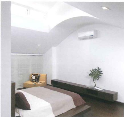
Skylight to bring natural light into bedroom