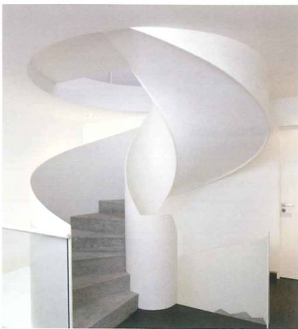
Spiral staircase leading to mezzanine floor