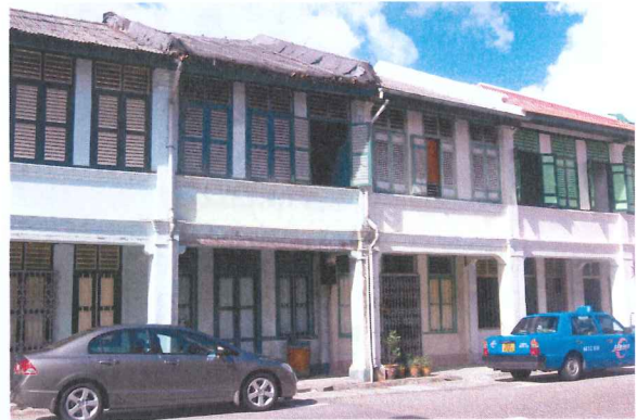
"Before" images of the row of 92-102 Joo Chiat Place shophouses.