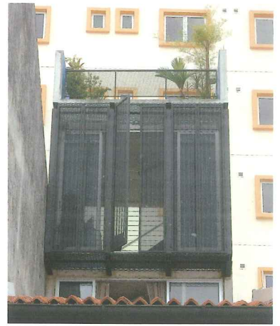
Lightweight steel mesh sunscreen over full-length glass windows