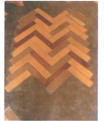
Patterned tile flooring