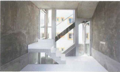
Raw and arty feel of study room at fourth level