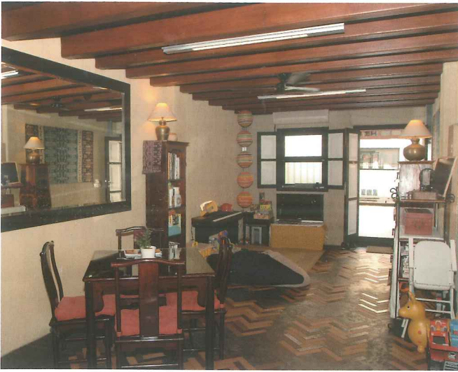
First storey interior with herringbone floor tiling pattern