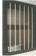
First storey window of traditional design