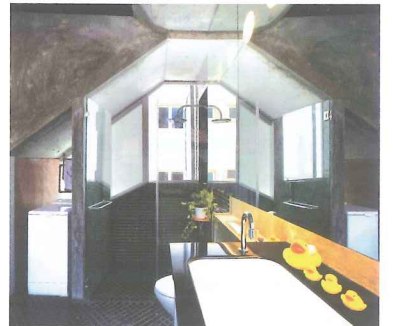
Modern fittings for today's living