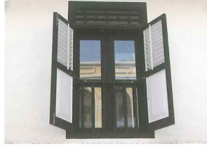
Original timber louvred windows