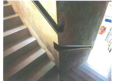
Handrails etched into existing wall