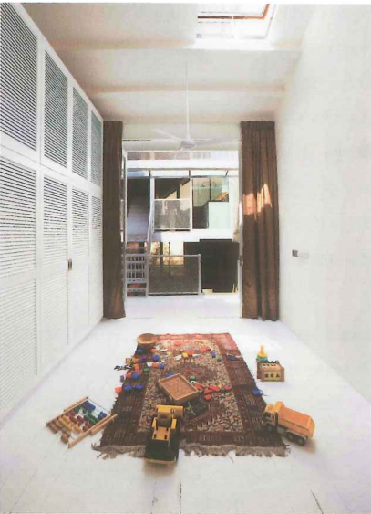
Spacious modern interior at second storey