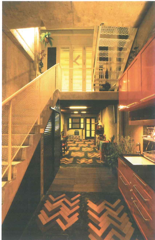
Expanded metal staircase spanning through narrow interior