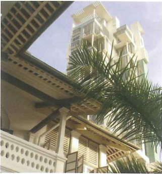
Perforated upper storey parapet wall