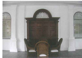
Entrance door retained