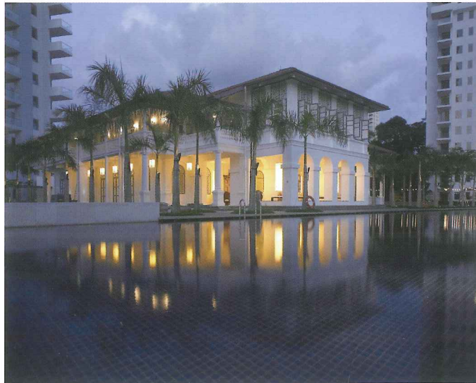
Classic colonial bungalow restored to former glory

Contiguous bored pilings ensured the stability of the bungalow while the condominium was being constructed. All existing doors and windows with