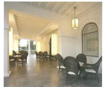
Verandah gives an open feel to clubhouse