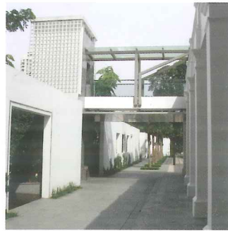
Lift cladded with granite and timber lattices set back from conserved bungalow