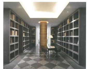
Book lobby at first storey