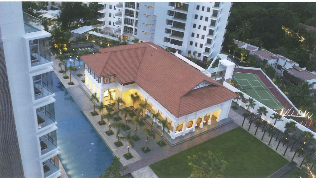
Aerial view of restored bungalow