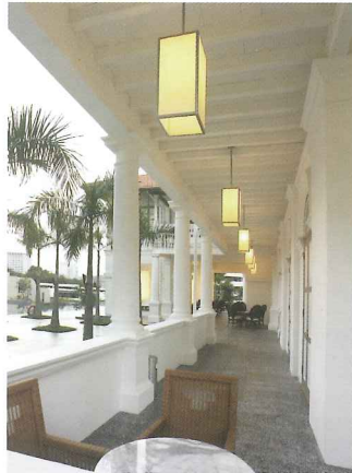
Colonnaded verandah kept