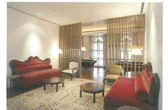
Second storey lobby