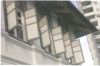
Restored timber louvred windows