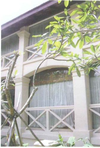
Cross-balustrades reinstated along corridors