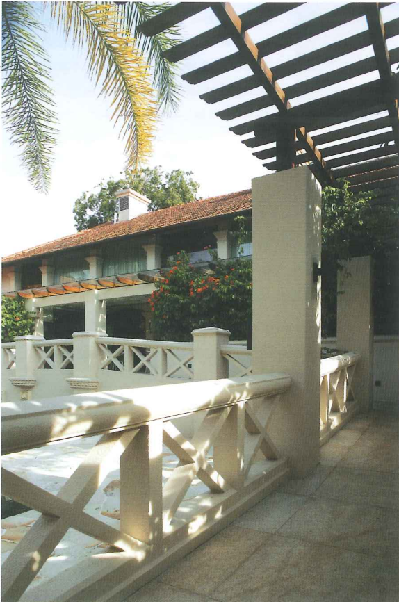
Spacious internal courtyard accentuated by cross-balustrade motifs