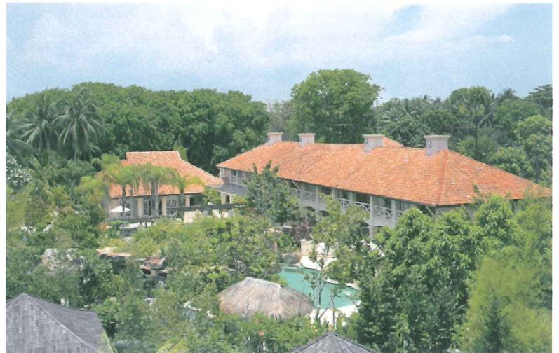
Aerial view of restored building amidst lush greenery