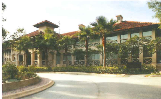
British military building rejuvenated to a modern spa

Block 59 on Sentosa Island was one of the many buildings built by the British between the 1880s to the 1930s to accommodate their garrisons. Once home to defenders of the harbour, the two-storey building is now a modern spa, Spa Botanica, in the soothing, rustic and charming ambience of Sentosa.