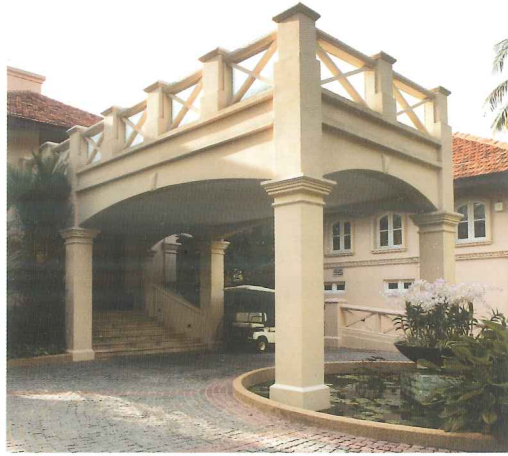
Cross-balustrade motifs carried through to the entrance porch