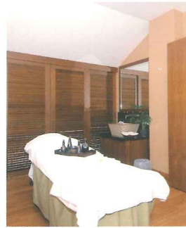
Internal space converted to a treatment room