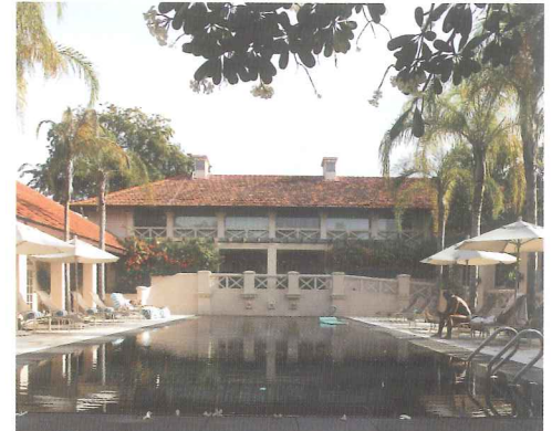
Heritage building forms a picturesque backdrop to the swimming pool