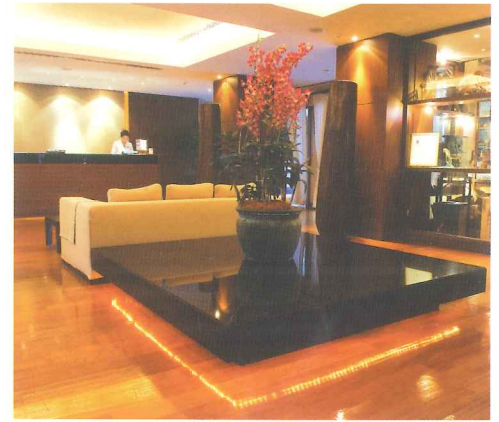
Spacious column-free reception lobby