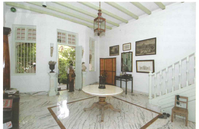
View of entrance foyer at the first floor