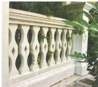
Forecourt balustrade in geometric design kept