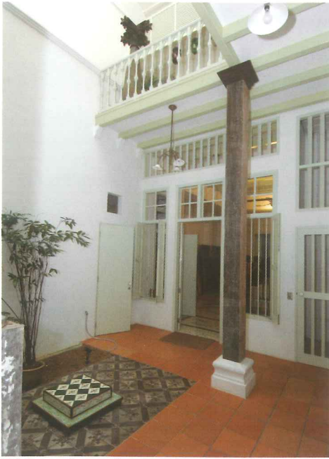
Well-lit covered courtyard serves as entrance to ground floor unit