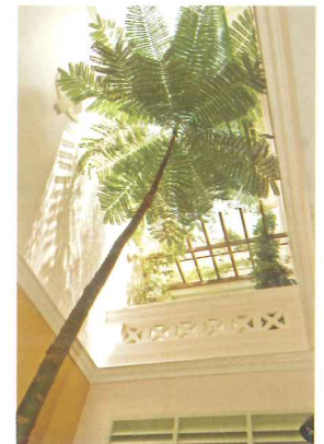
Open-to-sky rear court