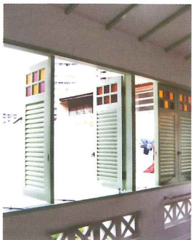
Replicated timber louvered windows at new extension