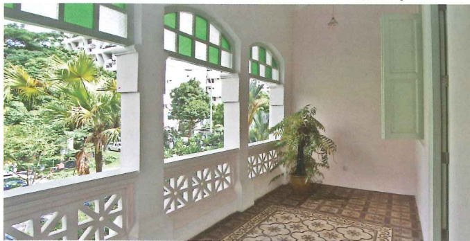
Restored verandah with original floor tiles