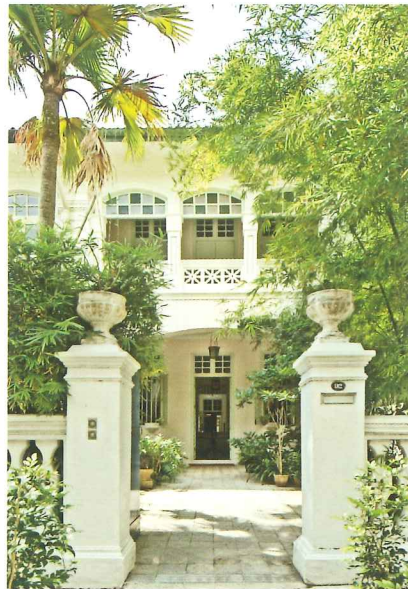
Entrance leading to the restored terrace house

At the entrance forecourt and the side boundary wall, the concrete balustrades with mouldings and ornate handrails were restored. Restoration of the front façade went beyond the timber windows and doors to include the old fashion vertical iron bars, original locking devices and fanlights to the first storey unit. Original cement floor tiles found at the first storey were carefully salvaged, restored and relaid at the entrance courtyard, covered internal courtyard and second storey front balcony. Timber joists, purlins and floor planks were carefully inspected, treated and reused.