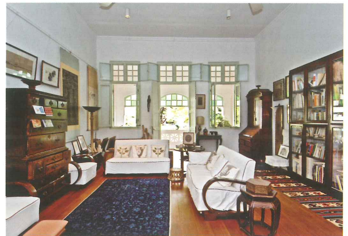
Living room at second storey