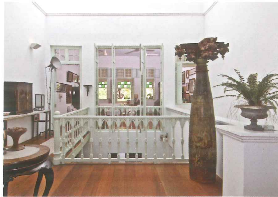
Light introduced into the covered courtyard through skylight