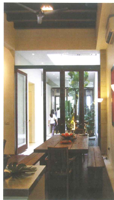
Well-lit dining area