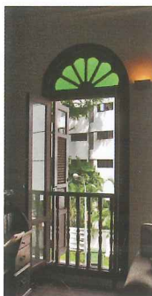
Timber louvred window and fanlight