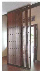
Bamboo pattern timber screen at foyer