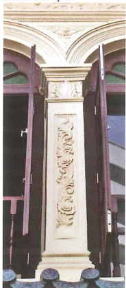
Rich details on upper storey pilaster