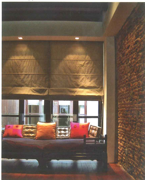
Exposed brickwall at rear bedroom