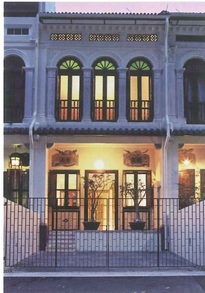
Restored and rejuvenated terrace house with decorative panels

The existing courtyards were landscaped as extensions to the living and dining areas and serve as an oasis where one can take a break from the busy city life. A pond was added to the central courtyard. Sitting in the middle of the pond was a large ficus tree which led the eye upwards for a glimpse of the living spaces above. At the rear courtyard, a tower tree with small delicate leaves contrasted well against the texture of the exposed brickwall. Sculptural