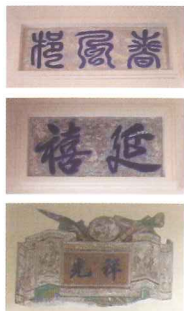
Decorative panels with Chinese scripts