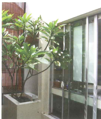
Open-to-sky rear courtyard