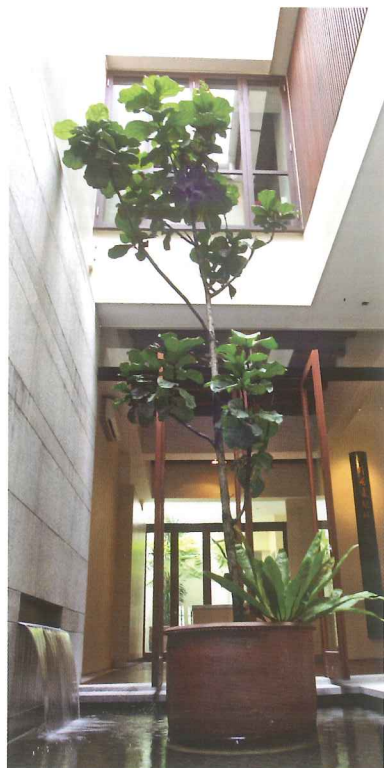
Landscaped courtyard with pond, stone finishes and ficus tree creates an urban oasis