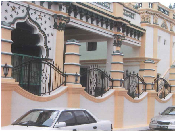
Reinstated boundary wall