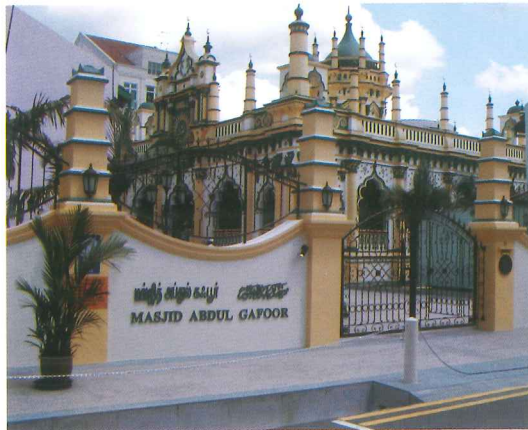
Monument restored to its former glory

In the early 1990s, the Mosque committee wanted to add a single-storey extension to create more prayer space. This led to the discovery that the structural integrity of the building was at risk. This also started an intense effort to save the Mosque from a gradual and certain collapse and spurred the remarkable restoration of this religious national monument.