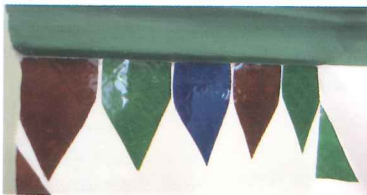
Uncovered glass decorations