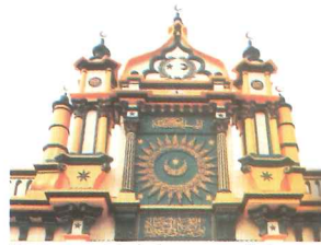
Pediment with elaborate sundial above the main entrance