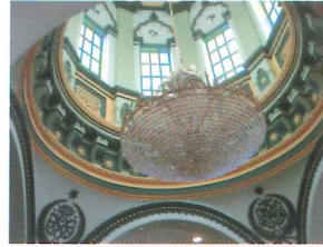
Interior of the central dome