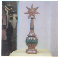
Timber ornament reinstated