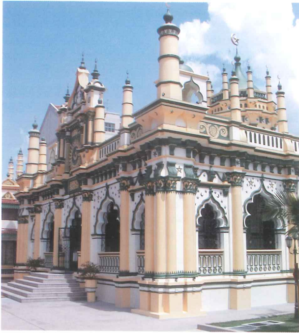
Resplendent Mosque complete its minarets