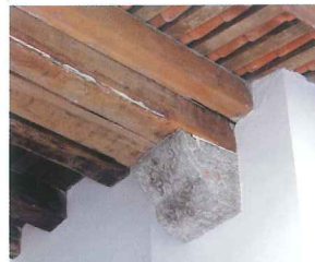
Carved corbel revealed