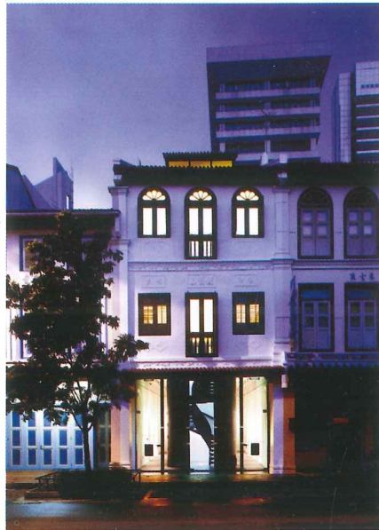
Restored and rejuvenated three-storey shophouse

Decorative plasterworks were carefully restored. Previous alterations by way of brick tiles and canopy were removed to reinstate the original look. Front corbels were stripped of heavy layers of paint that concealed exquisite granite carvings of old. Windows, still in excellent condition, were stripped of their paint to reveal their natural timber finish while new windows, which were added, followed the proportion and detailing of the originals. During restoration, an old granite footpath edging was uncovered and kept at the front boundary of the house. Floorboards saved from minor termite and water damage were reinstated.