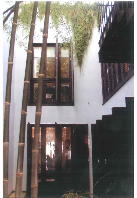
Bamboo landscaped courtyard