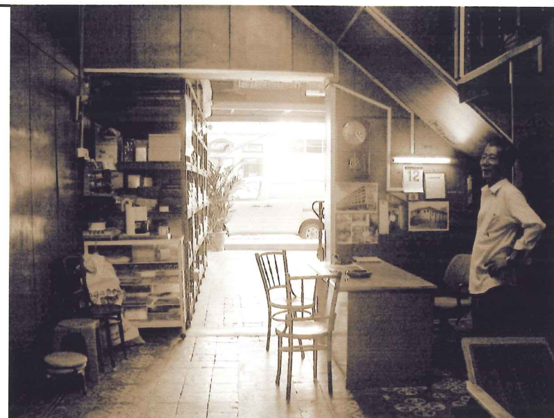
Old Shop Interior

Research into the building was done as follows: Oral history, from talking to the existing owner. Typology history, from publications on the shophouse typology. Locality history, from publications on the Telok Ayer vicinity. Architectural design research, into the potential of the shophouse to provide a contemporary office environment. Structural and architectural research, into the existing condition of the building.