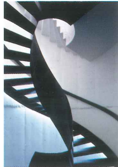
Bold new spiral staircase