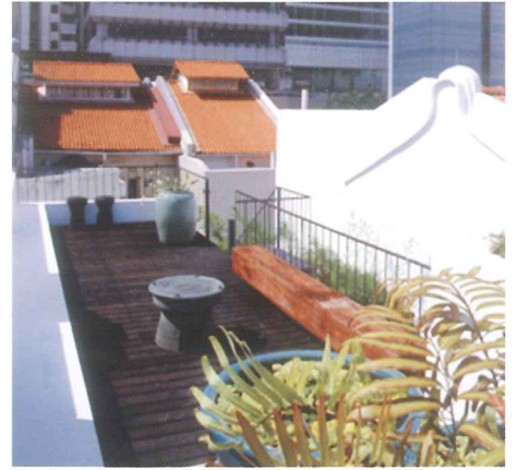
Garden in the sky