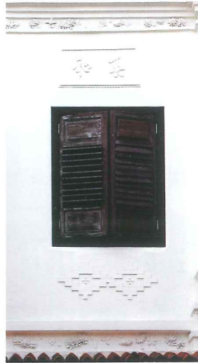
Original window and plasterworks retained