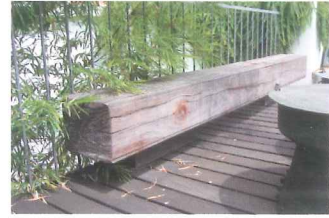
Timber beam reused as a bench