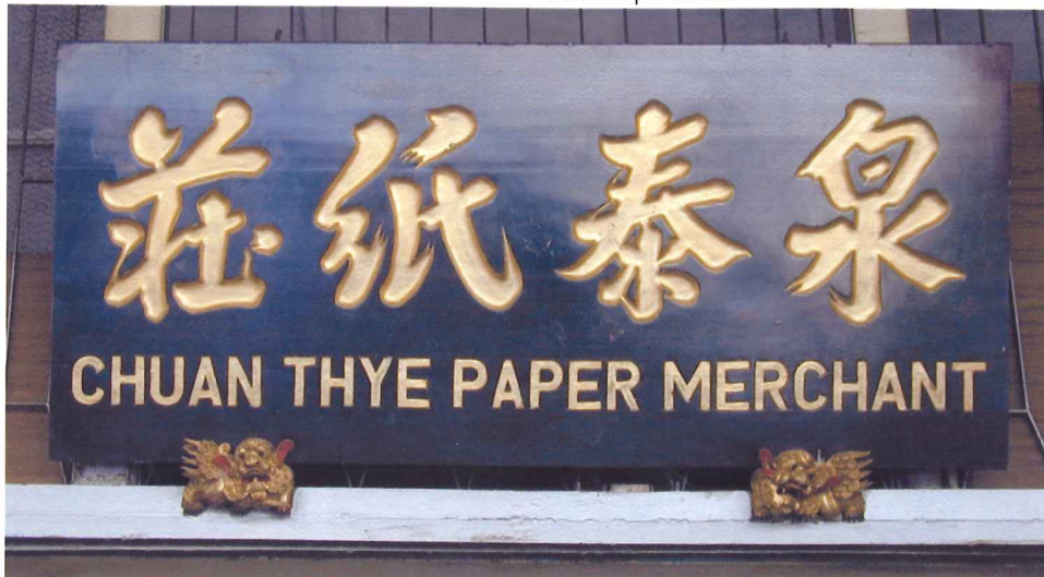
Old Shop Signboard