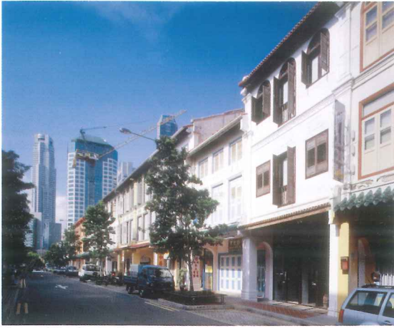
Restored shophouse along Telok Ayer Street