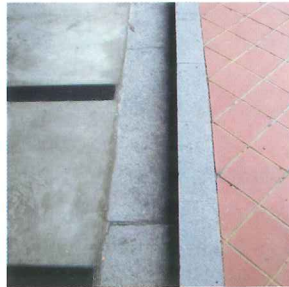
Original granite edgings