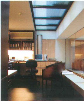
Naturally-lit office space