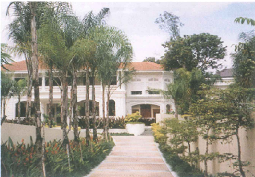
View of restored bungalow from Nassim Road