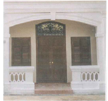
Arch opening with keystone and decorative moulding