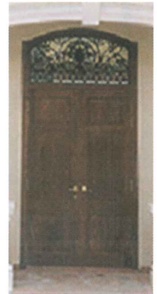
Wrought iron grille transom and panelled timber door kept