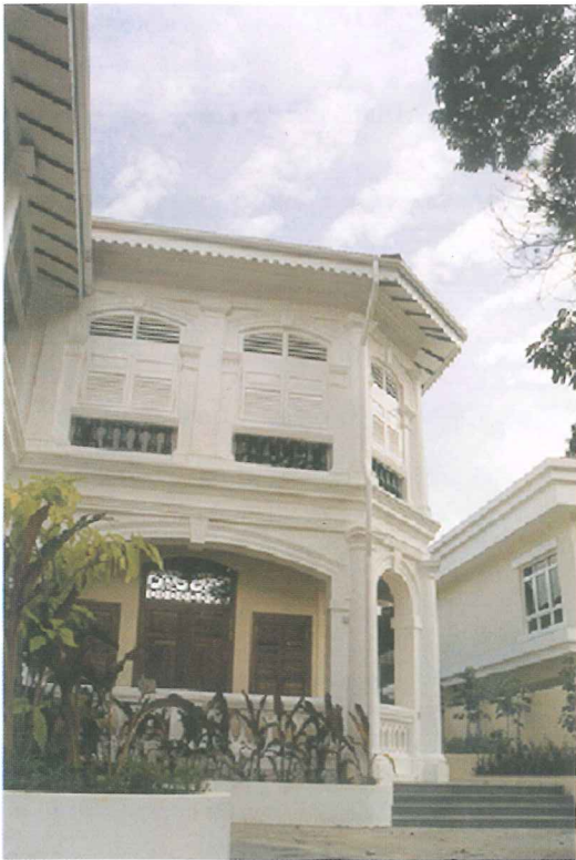
Part of front facade after restoration