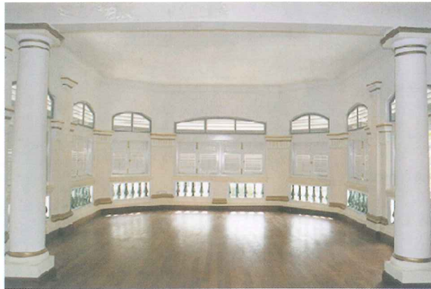
Circular Doric columns kept in new family area