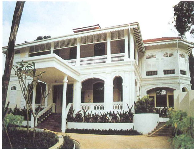
Conserved bungalow adapted for modern living

Externally, all architectural elements were either retained and restored or reinstated to original form. The main entrance was relocated and a new porch built, while the old entrance was transformed into an