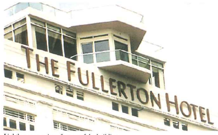
Lighthouse, a unique feature of the building