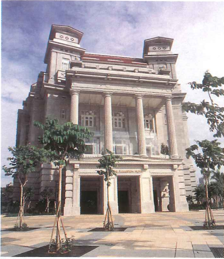
Exterior facade in Shanghai plaster finish with grand Doric columns