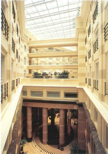
Sunlit atrium which doubles as the hotel lobby