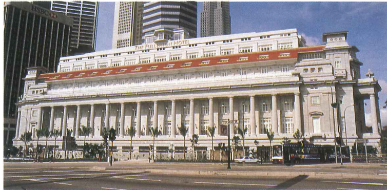
Majestic Neo-Classical building transformed to a "deluxe hotel"

Prior to restoration, archival documents and historical photographs were extensively researched to determine previous changes to the building and to guide the interior design efforts. A measured building survey was also commissioned to accurately and comprehensively record the architectural details of the building. This facilitated the necessary repair and replacement works. The existing foundations were carefully shored up in areas where deep excavation was necessary to create new hotel facilities like the ballroom and service driveways. Extra precautions were also taken to protect the Cavenagh Bridge foundations which were partly within this site.