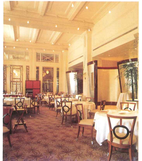
High coffered ceiling and double volume space retained