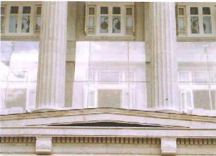
Clever use of glass for air conditioning comfort while retaining character of the building