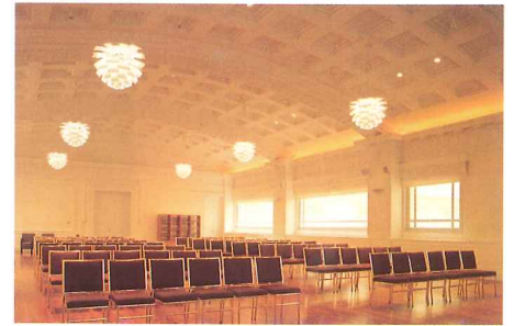
Ornate barrel vaulted ceiling and wall mouldings kept intact