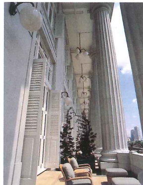
Double-volume verandah with city view