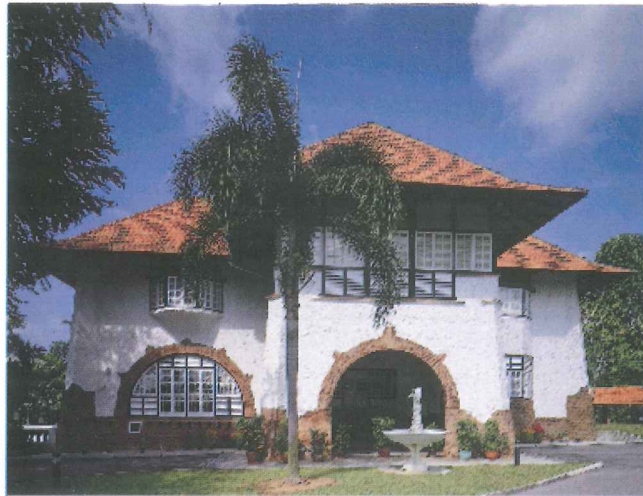
A sensitively restored bungalow