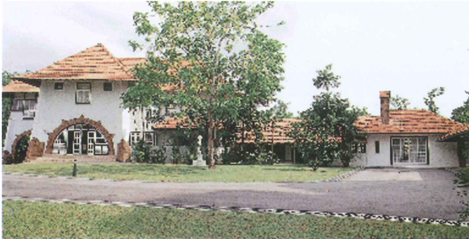
View of mainhouse and outhouse