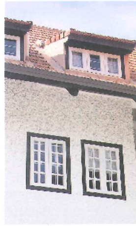
Dormer windows for light and ventilation to attic