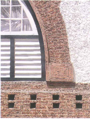
Geometric spiral brickwork and vents to space below ground