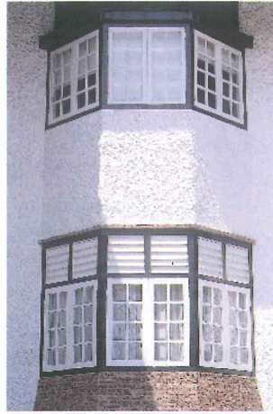
Oriel windows restored