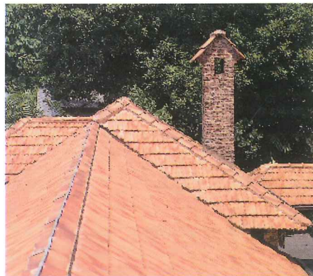
Old chimney stays kept