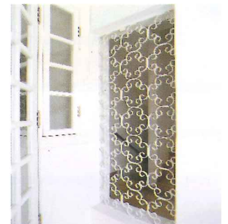
Original metal grilles retained