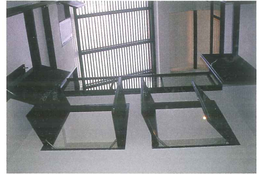
Skylight introducing light into the restored house