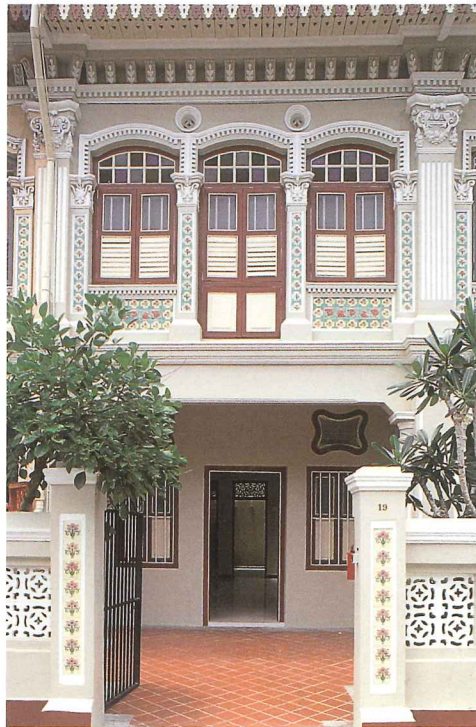
The restored elaborate facade of the Late Style terrace house

The main facade of the building which features segmental