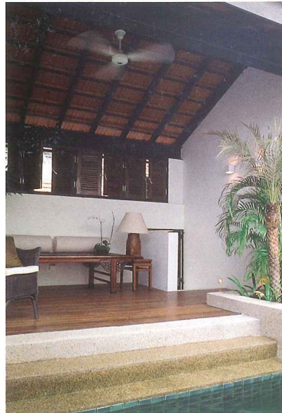
Plunge pool at new rear extension