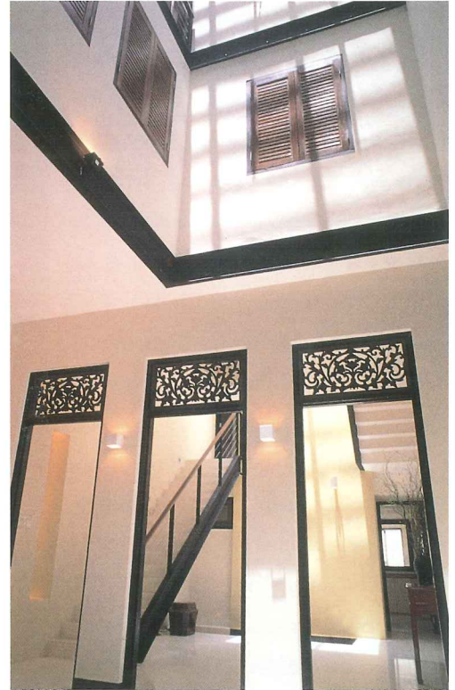
Three carved timber screens frame the entrance way to the atrium space