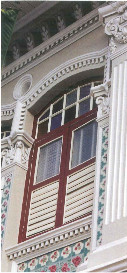
Restored windows with ornate mouldings