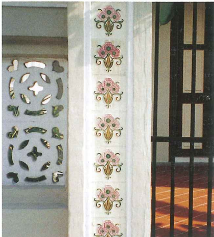
Tiled gate post and forecourt wall with perforated precast concrete vents