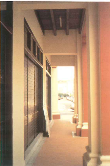
Five-footway reinstated to original condition and function