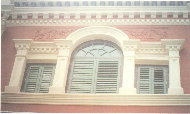
Restored windows and decorative pilasters and mouldings