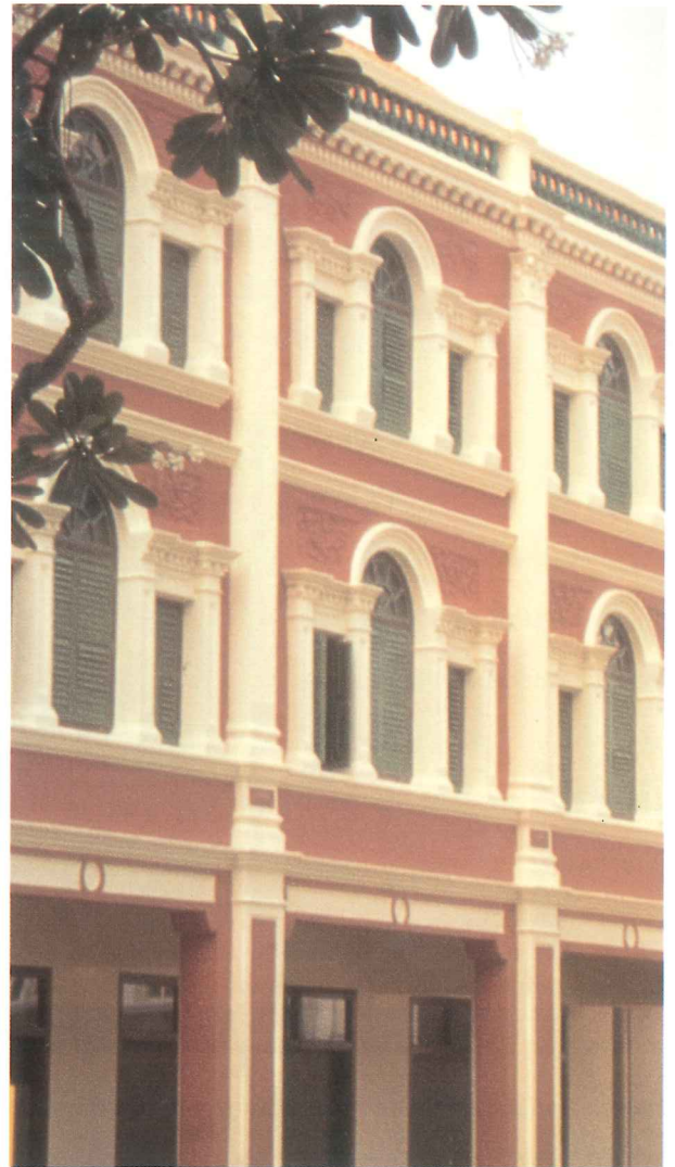
Decorative pilasters and external ornamentations retained and sensitively restored