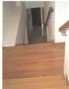
Timber staircase leading to upper floors