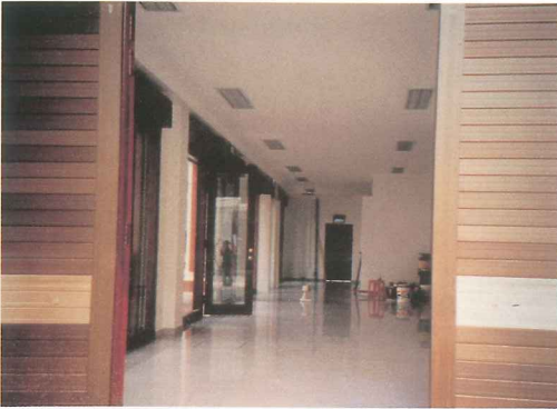
Retention of spatial quality at 1st Storey