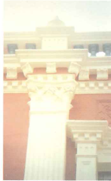
Restored secondary pilasters at upper storey