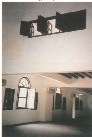
2nd Storey interior of shophouse