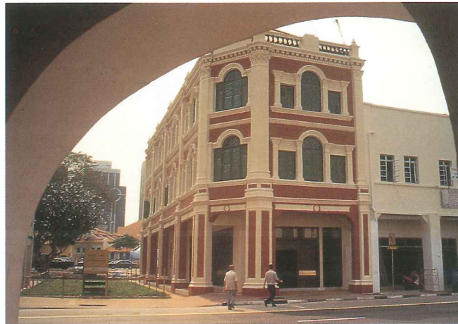
Restored shophouse in original grandeur

This three-storey corner shophouse of the Late style is located within the Historic District of Chinatown. Prior to restoration, the building was in a fair condition. However, most of its roof structure was in need of repair and its wall surfaces covered with