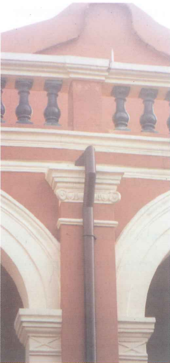
Ionic column capital between the moulded architraves