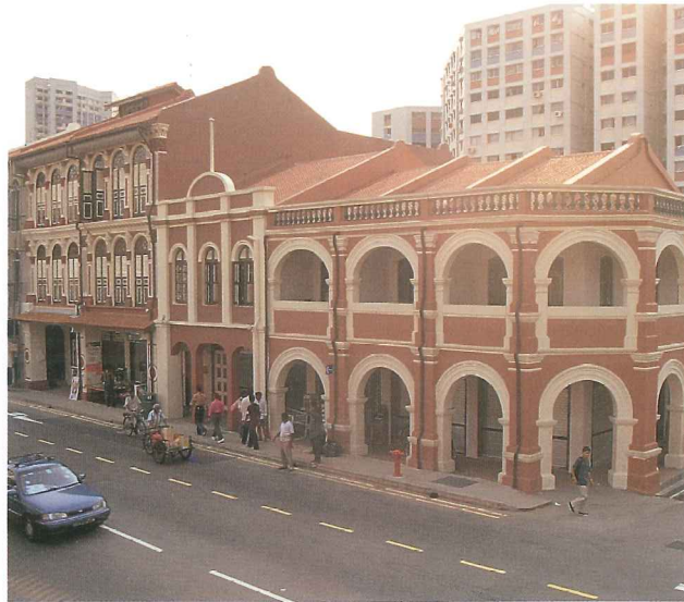
Facades carefully restored to their original splendour

L ocated in the Historic District of Little India, the three units of two-storey Transitional shophouses were originally in a derelict state. The roof of unit No. 131 had caved in and was on the verge of collapse, with weeds and shrubs sprouting from most of its walls and its remnant tiled roof. Debonding of the plaster