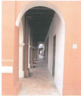
Colonaded covered five-footway