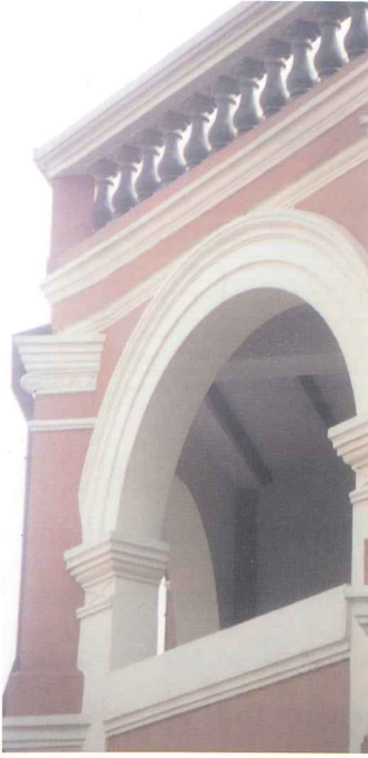
Carefully restored architectural features on the facade