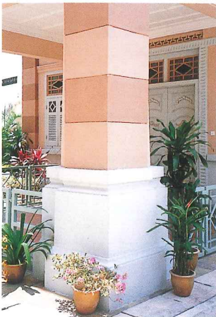
Geometrically designed column with elegant groove lines