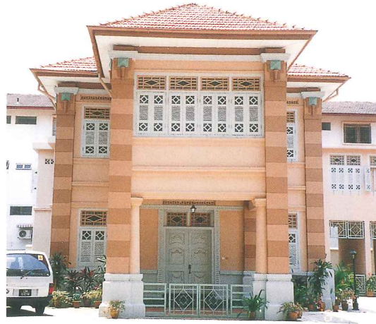
Conscious effort to provide sufficient frontage to the conservation bungalow

T his pair of two storey Art Deco bungalows is located in the Geylang Secondary Settlement where a new extension is allowed up to the Development Guide Plan (DGP) height and plot ratio. To maximise the plot ratio, the owner decided to integrate a new 8-storey residential addition to the bungalows. As the