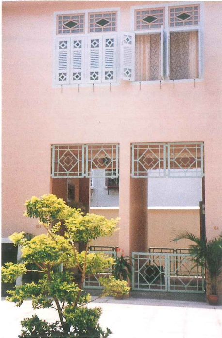
Original second storey parapet linkage retained and redesigned to house the master bedrooms