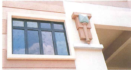
Original mouldings replicated on the new apartment block to integrate the new with the old