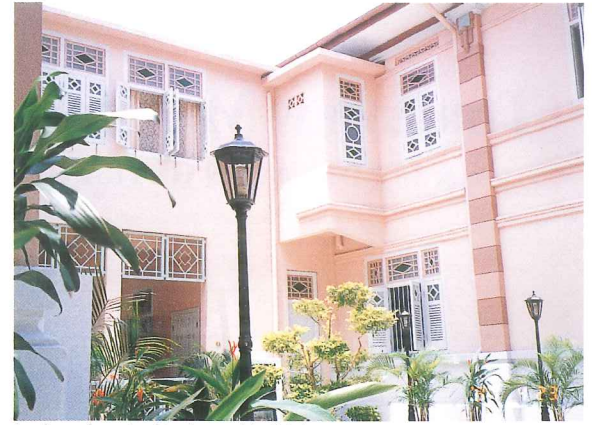
Landscaped courtyard to give a residential character