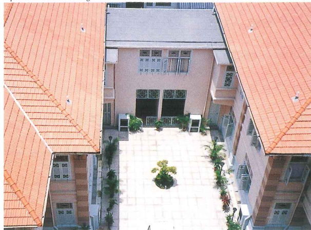
Aerial view of the intimate courtyard space between the two conservation bungalows