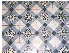
New tiles sourced to match existing