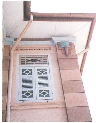
Detailed mouldings and elegant groove lines highlighted through a play of colours