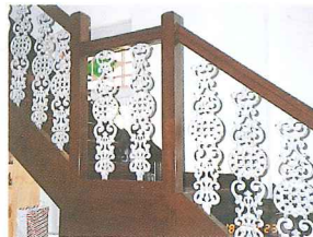
Intricately designed original cast iron balustrades retained, with missing ones replaced to match existing