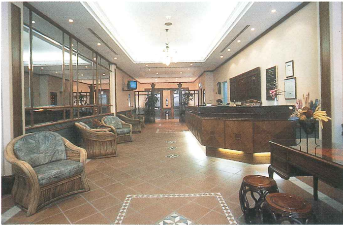
Interior of hotel lobby retains the spatial quality of the shophouse