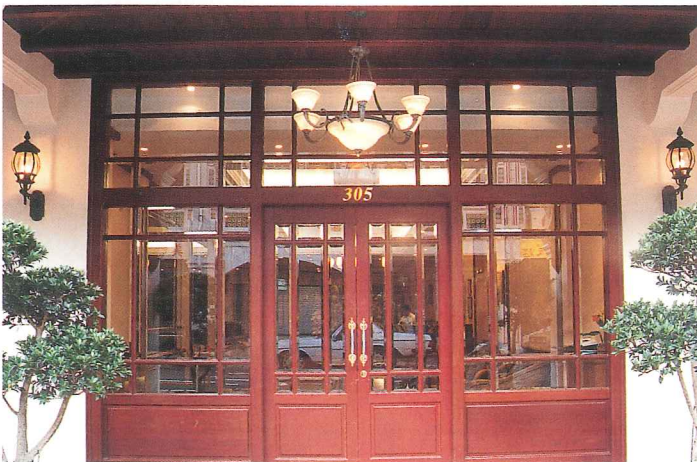
Light fittings of dye-cast aluminium at lobby entrance to achieve the unique charm of the old days