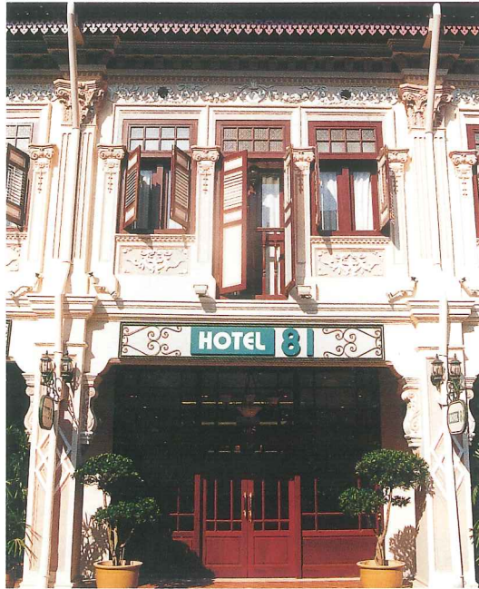
Front facade sensitively restored to original details and finishes

L ocated in the Joo Chiat Secondary Settlement where a four-storey rear extension is allowed, the development retains the main buildings of 6 two-storey shophouses of the Late Style and integrates a four-storey extension at the rear. This ensures the retention of the shophouse streetscape whilst maximising the development potential of the site through the creation