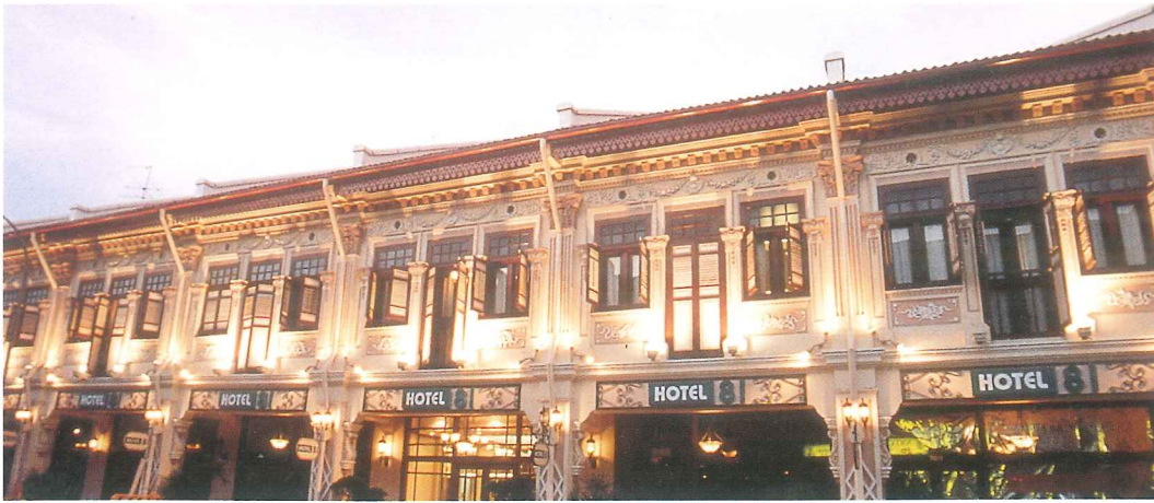
Illuminated front facades exude the intricate beauty of the late style shophouses