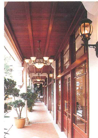
Five-footway enhanced to provide visual continuity