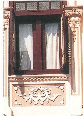
Motifs restored to original splendour