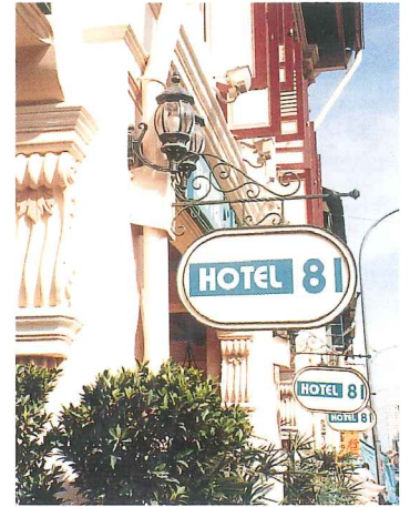
Wrought iron signage in keeping with conservation theme