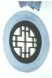
Circular window at second storey