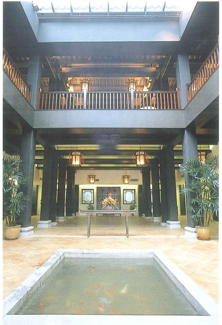
Skylight at courtyard admits natural light and enhances the architectural serenity