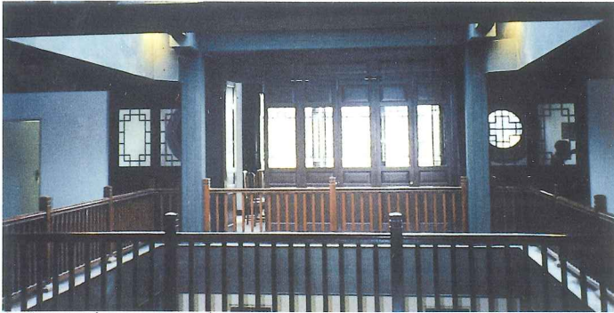
Spacious second storey serves as a function area