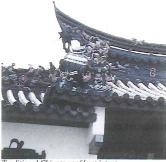
Traditional Chinese roof kept intact