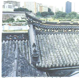
Chinese roof restored to original pitch and colour