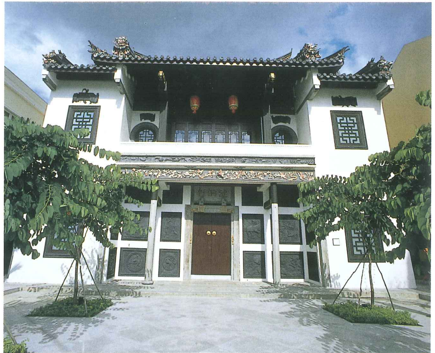
River House exudes its past splendour in today's setting

This southern Chinese-style mansion was built in the 1880s and is the oldest building in Clarke Quay. Having served as a residence and godown for gambier, biscuits and other commodities, it was faithfully restored by skilled craftsmen in 1993. Every effort was made to meticulously re-create its original intricacies and recapture the charm and spirit of Singapore's heritage. The restored building, one of the only two traditional Chinese-style dwellings remaining in Singapore, contributes to the rejuvenation of the Singapore River and the transformation of the riverfront area into a retail, recreation and entertainment belt.