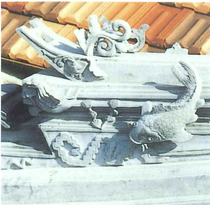
Decorative ridge beams and motifs finished with the sculptured figurines